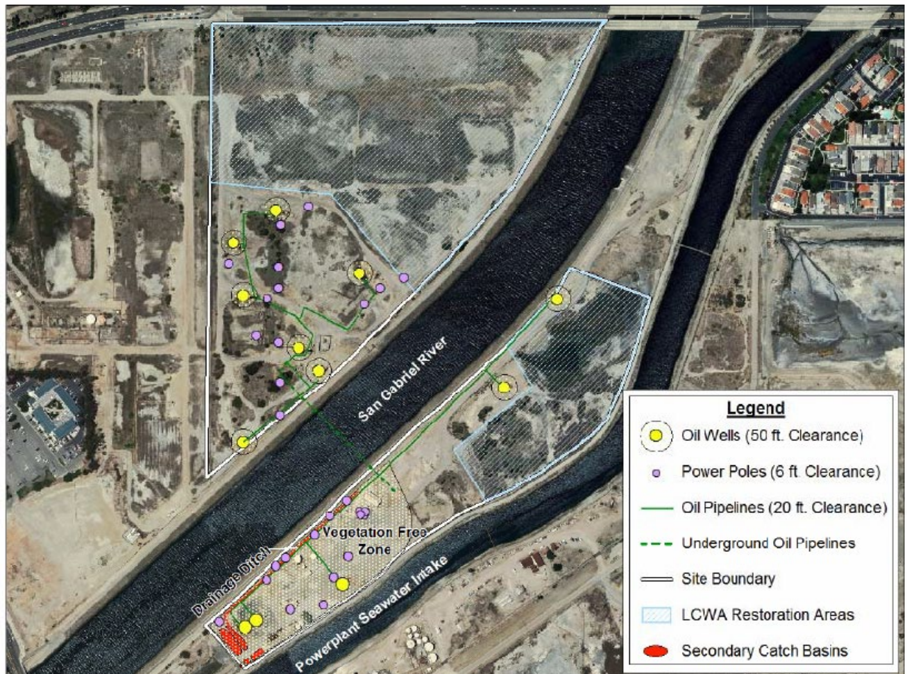
Figure 1 Signal Hill Petroleum, Inc. proposed maintenance activities, located within the LCWA Phase 1 properties

Figure taken from Signal Hill Petroleum Bryant Lease Vegetation Maintenance Project, California Coastal Commission CDP Application Package, September 1, 2010