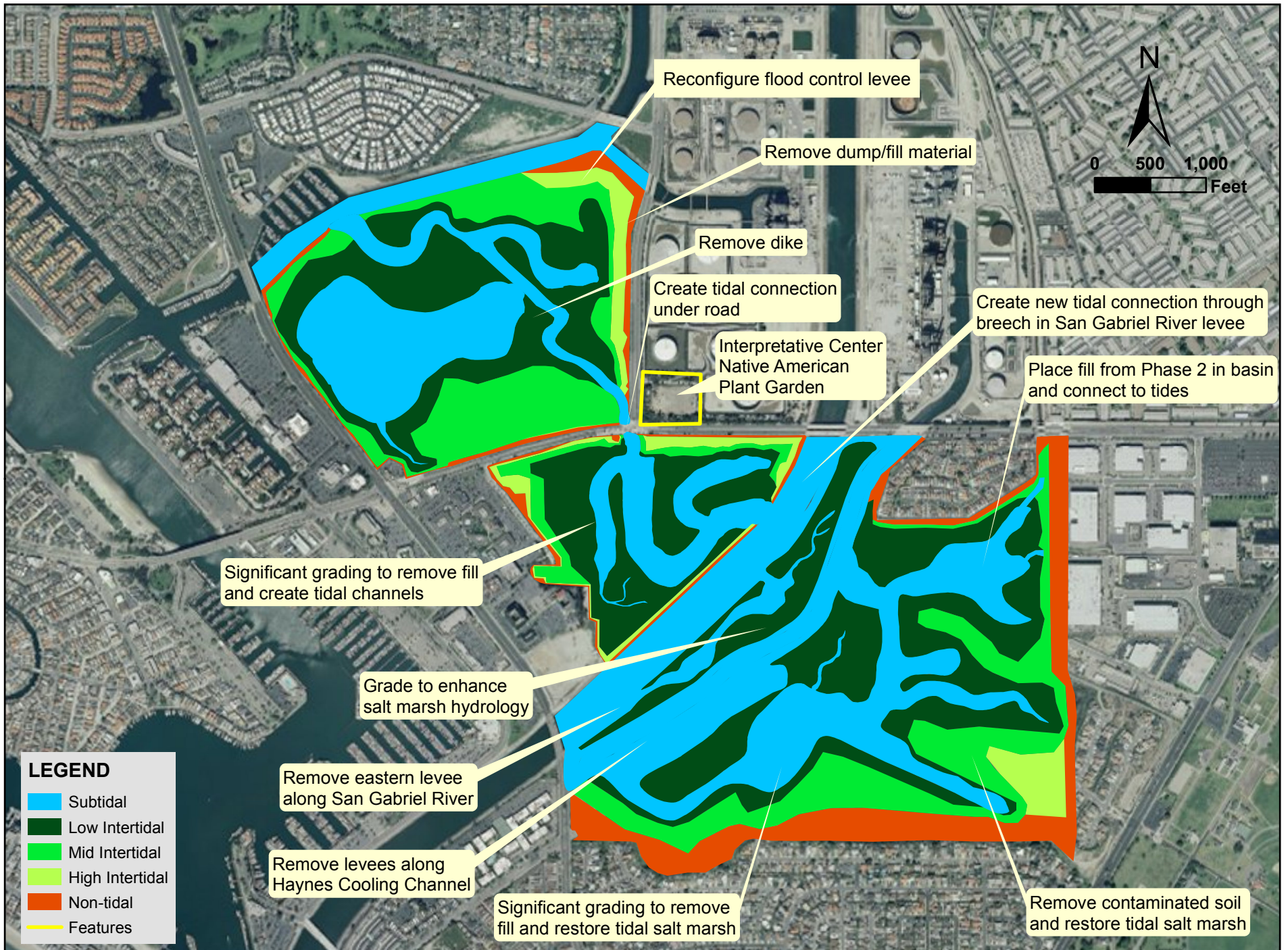
Screen. Alt. 2: Sea Level Rise Adaptation - Maximum Touch (at 2 ft Sea Level Rise)