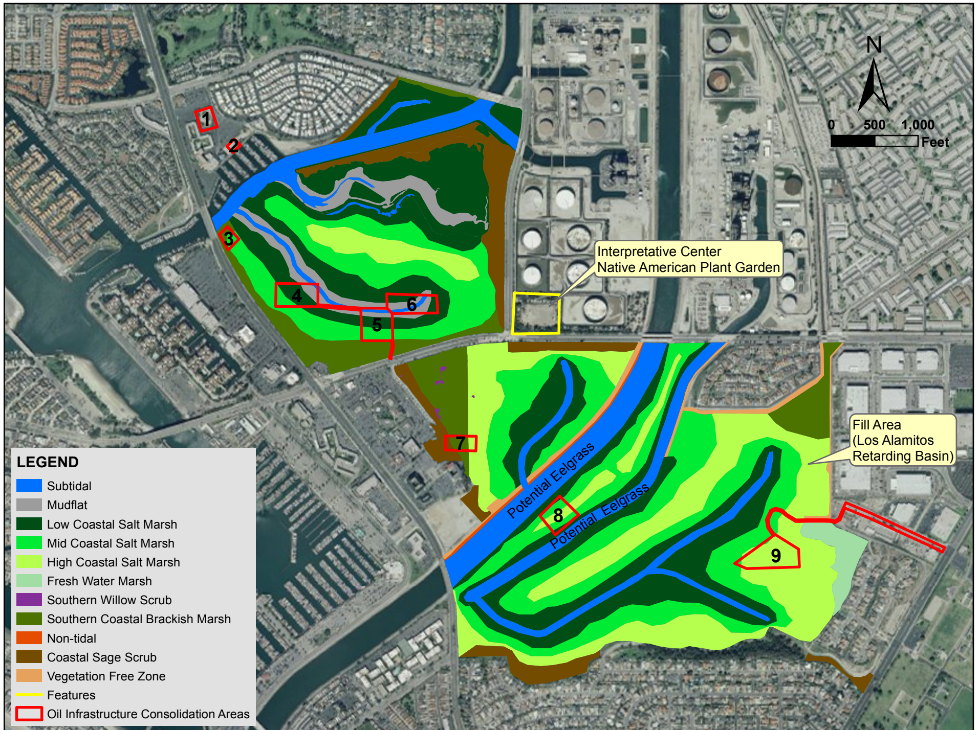
Screen. Alt. 6: Habitat Diversity - Maximum Touch