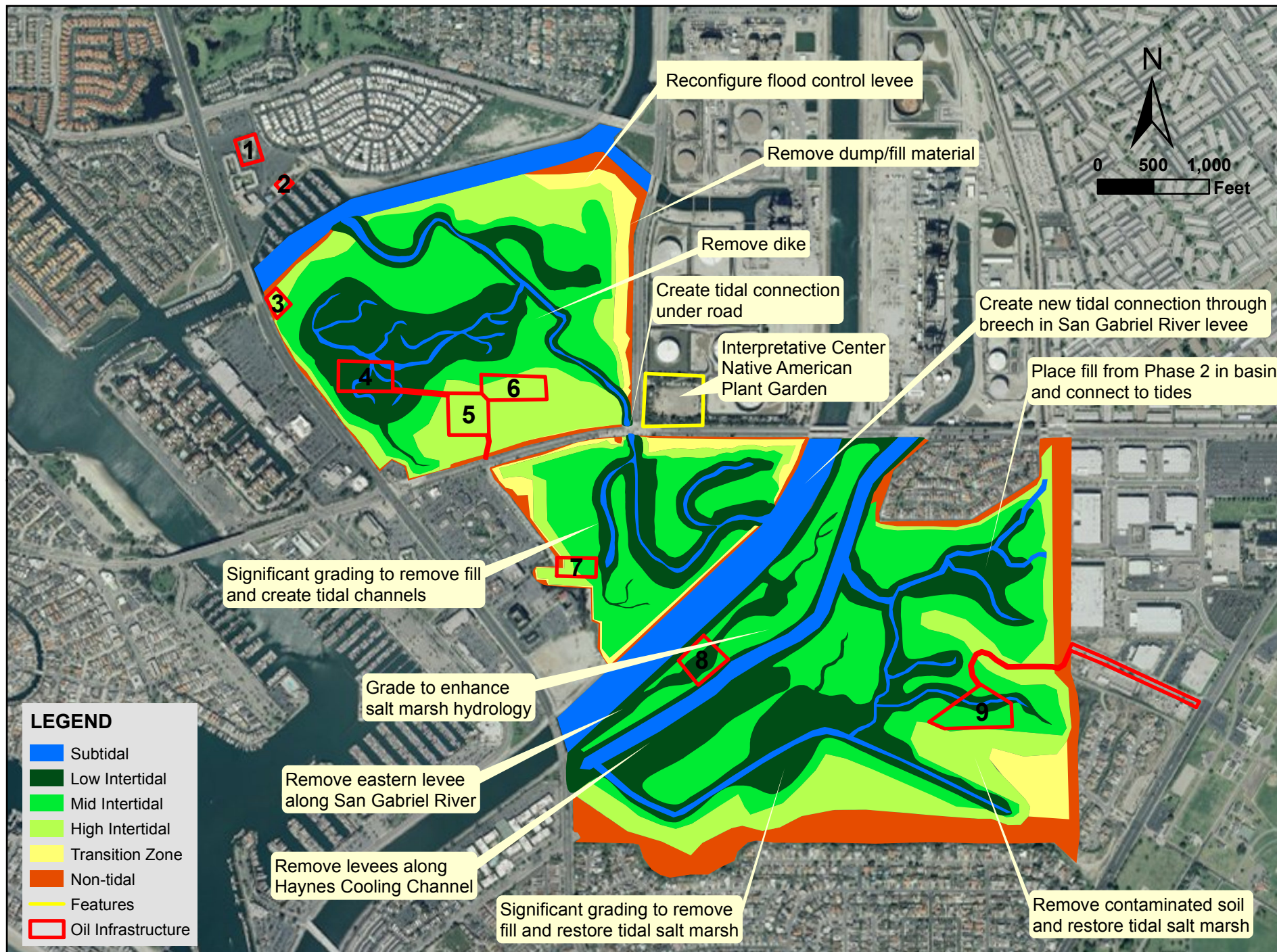
Screen. Alt. 2: Sea Level Rise Adaptation - Maximum Touch (at Current Sea Level)