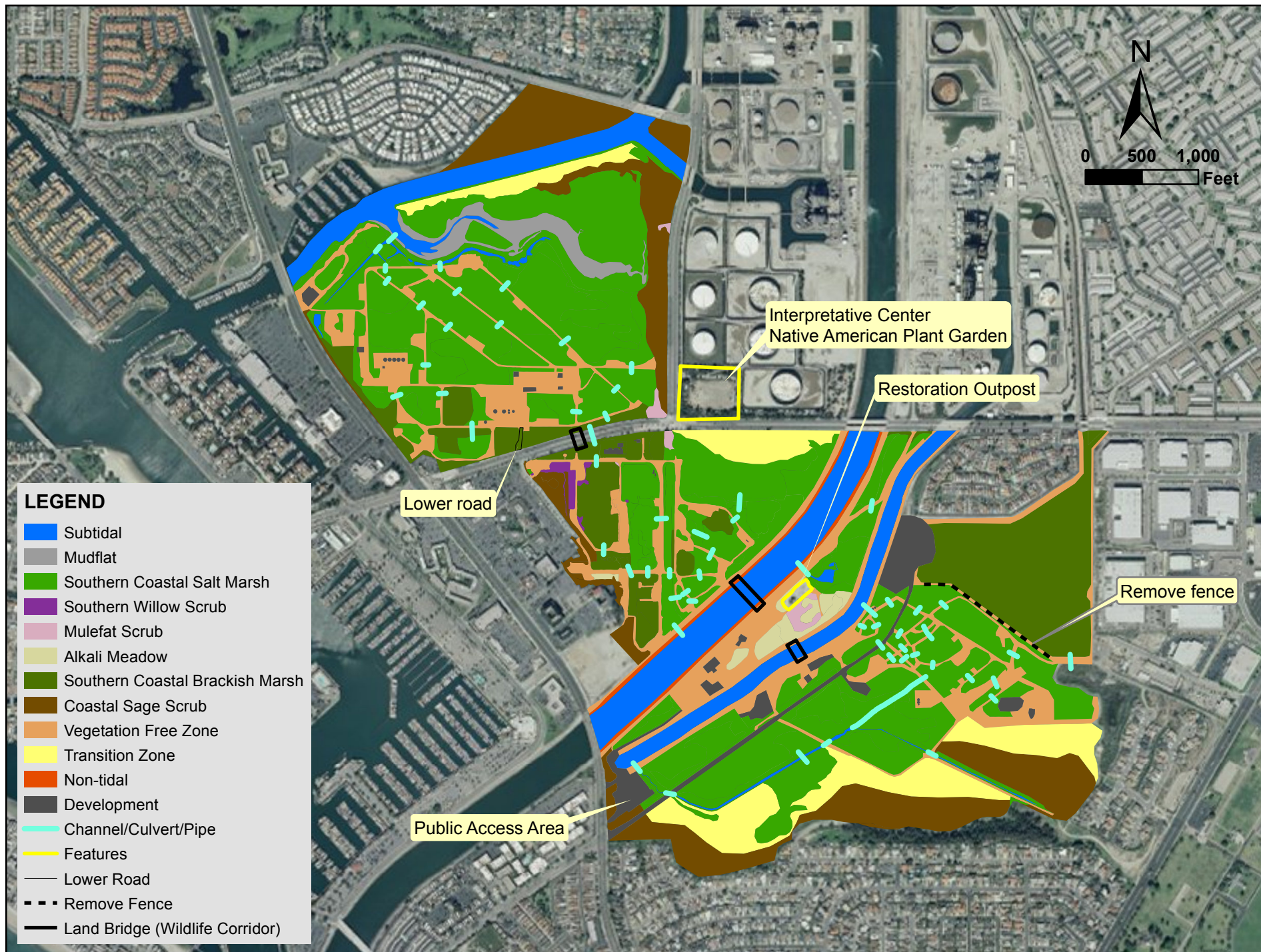
Screen. Alt. 3: Connectivity - Minimum Touch