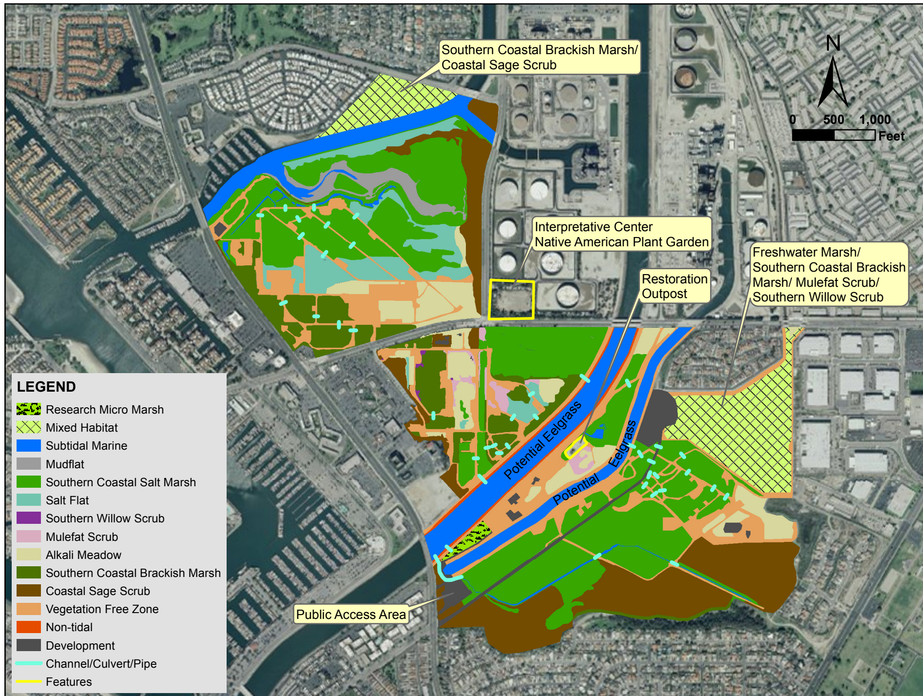
Screen. Alt. 5: Habitat Diversity - Minimum Touch