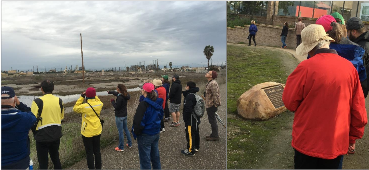
FIGURE 1. LAND TOURS IN LOS CERRITOS WETLANDS...COME RAIN OR SHINE THIS SEASON!