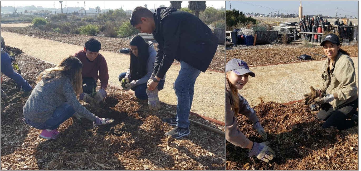
FIGURE 3. LBCC STUDENTS AND STAFF PARTICIPATE IN SERVICE LEARNING ACTIVITIES AT ZEDLER MARSH