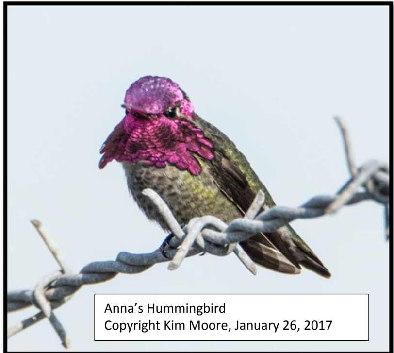
Anna's Hummingbird Copyright Kim Moore, January 26, 2017

View this checklist online at http://ebird.org/ebird/view/checklist/S33672426 This report was generated automatically by eBird v3 ( http://ebird.org )