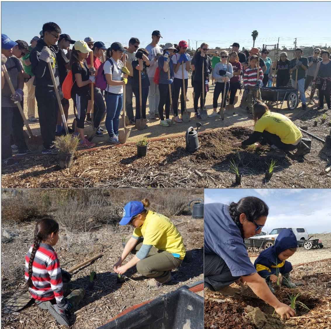
FIGURE 2. HABITAT RESTORATION EVENTS NOVEMBER - JANUARY