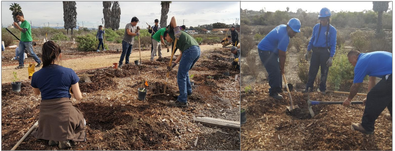
FIGURE 4. LBCC STUDENTS AND CONSERVATION CORPSMEMBERS INSTALLING VEGETATION AT ZEDLER MARSH TRAILS