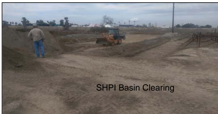
SHPI Basin Clearing