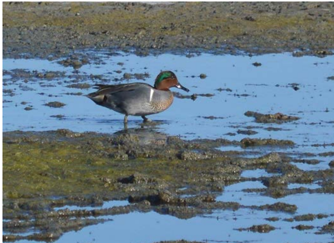
Figure 2: Green-winged Teal, February 2017