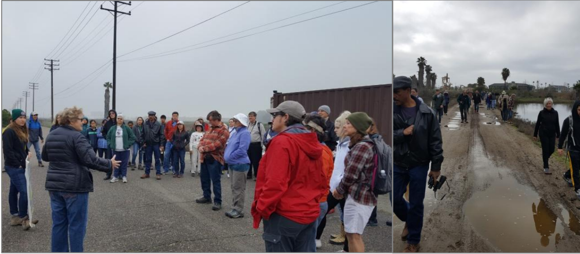
FIGURE 1. LAND TOURS IN LOS CERRITOS WETLANDS...PLENTY OF WATER THIS SEASON!