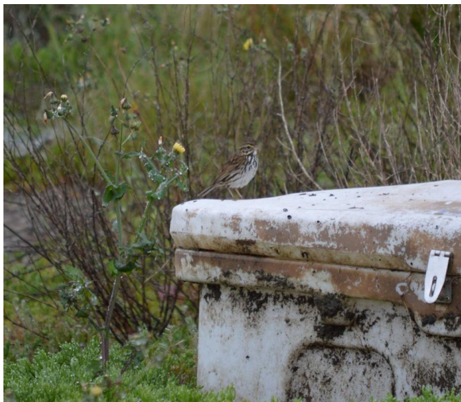
Figure 4: Belding's Savannah Sparrow, April 2017