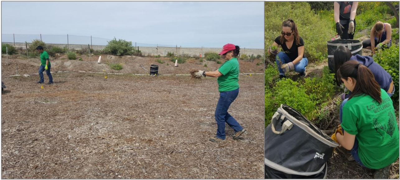
FIGURE 3. SPREADING TARPLANT SEEDS AND REMOVING NON-NATIVE PLANTS AT THE MARCH 2017 RESTORATION EVENT