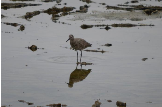
Figure 3: Willet, April 2017