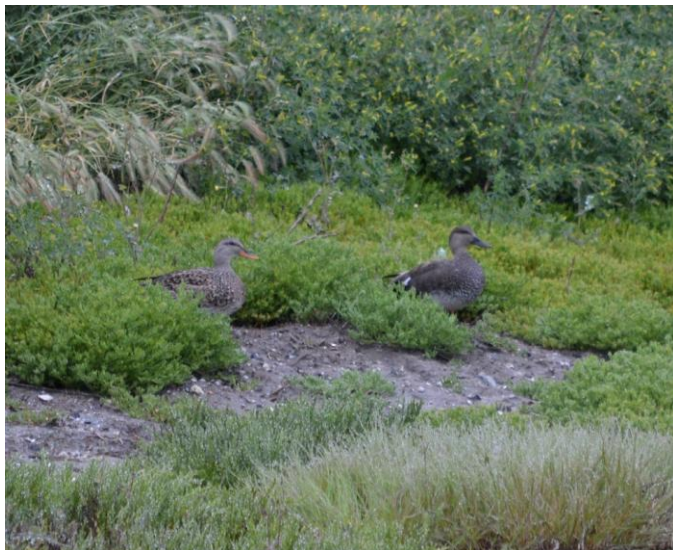
Figure 5: Gadwalls, April 2017