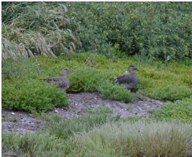
Figure 5: Gadwalls, April 2017 - Photo Credit: Cindy Crawford