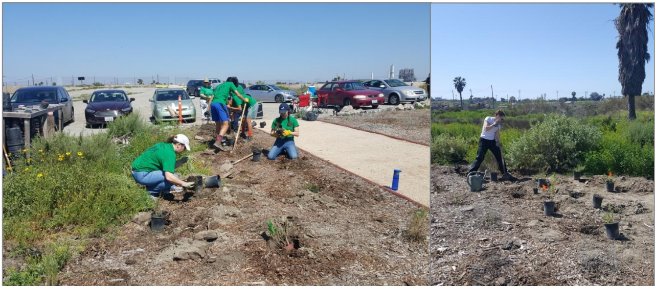
FIGURE 4. PLANTING ALONG THE ZEDLER MARSH TRAILS AT THE APRIL 2017 RESTORATION EVENT