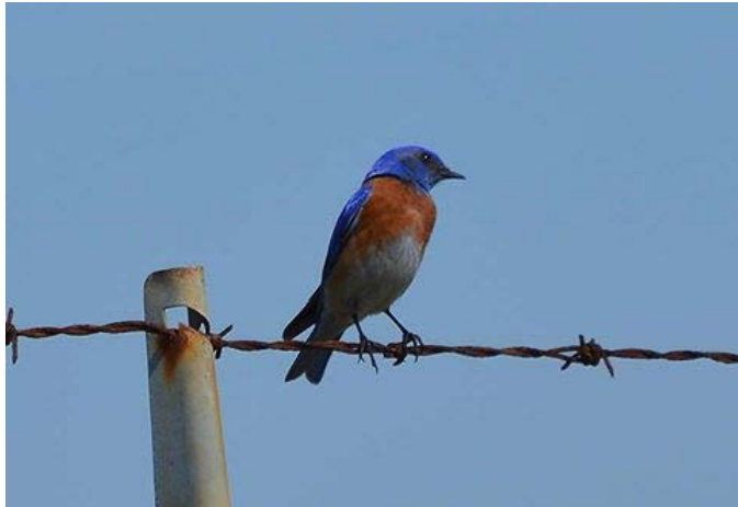
Figure 1: Western Bluebird, March 2017 - Photo credit: Cindy Crawford