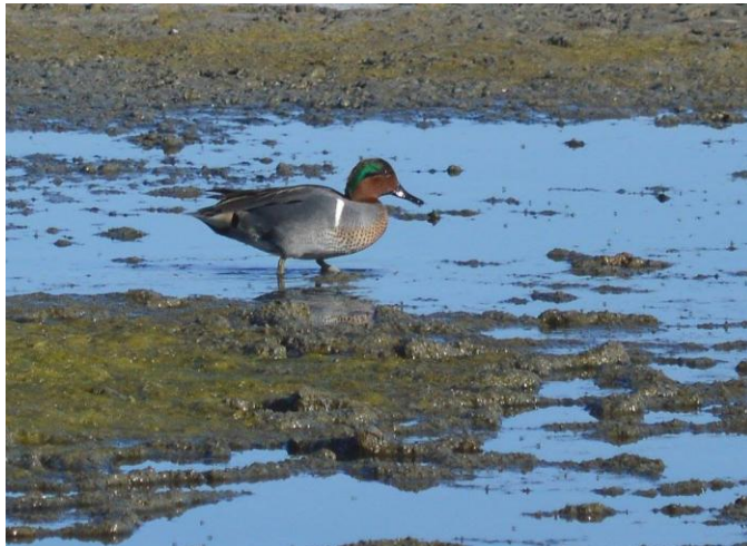
Figure 2: Green-winged Teal, February 2017