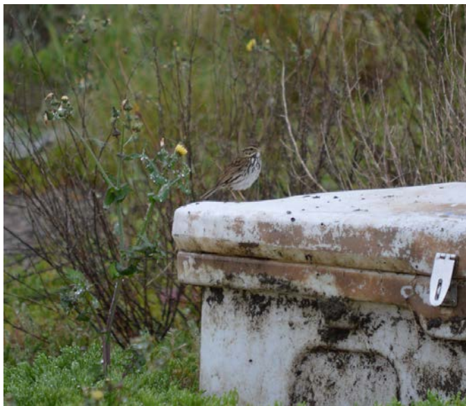
Figure 4: Belding's Savannah Sparrow, April 2017