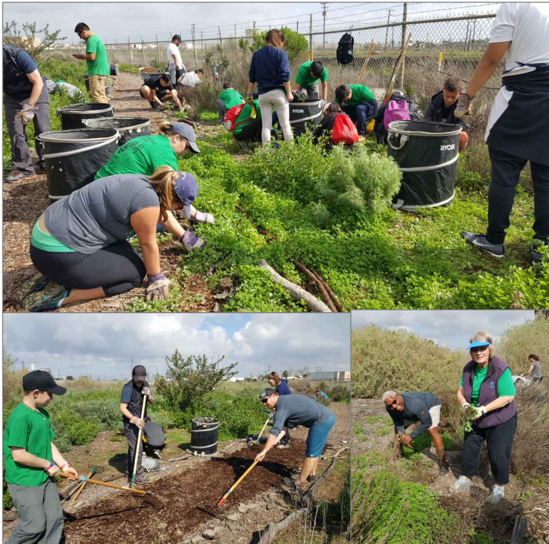
FIGURE 2. REMOVING NON-NATIVE PLANTS AT THE HABITAT RESTORATION EVENT IN FEBRUARY 2017