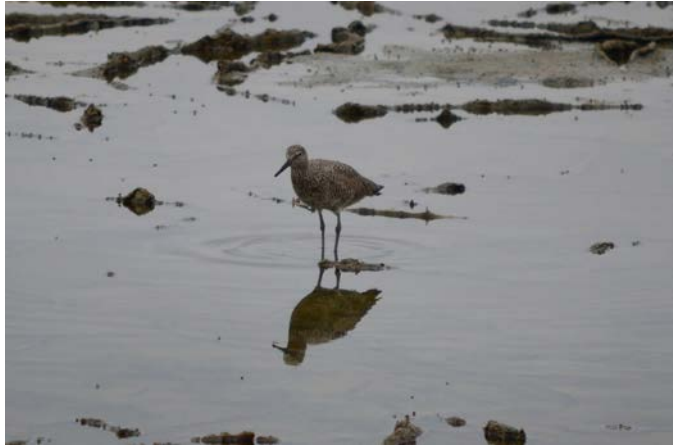
Figure 3: Willet, April 2017