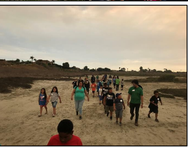
FIGURE 4. AUGUST BESAFE FIELD TRIPS