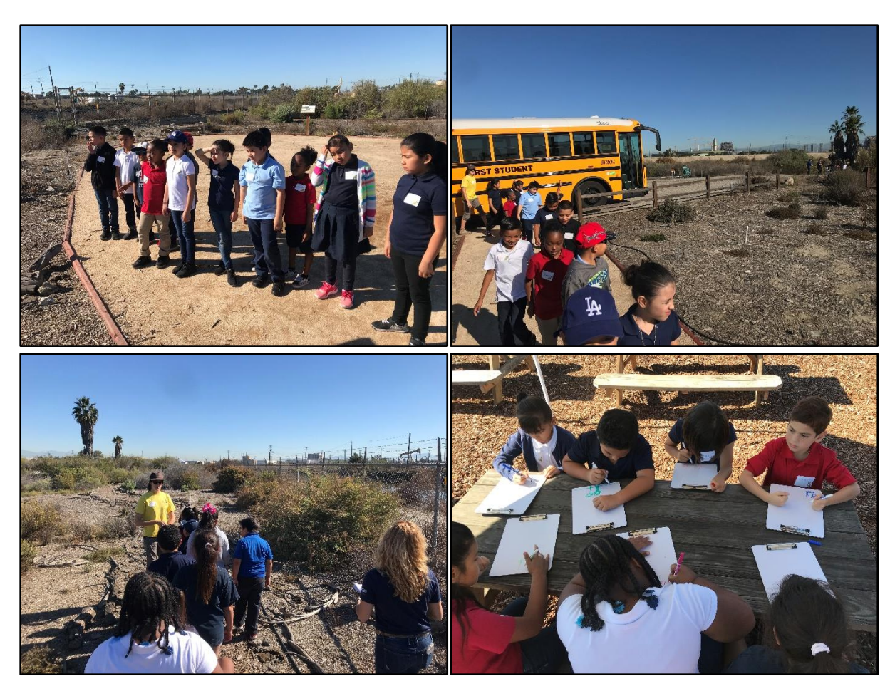
FIGURE 5. EXPLORE THE COAST PROGRAM FIELD TRIPS