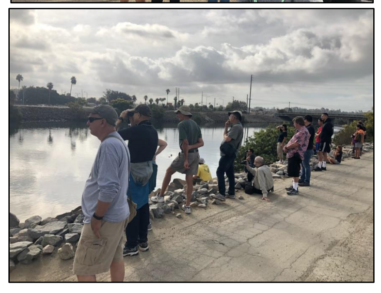
Figure 1. Heron Hike (Top & Middle), Turtle Trek (Bottom)