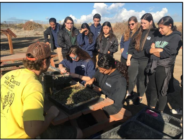
FIGURE 3. PORT OF LOST ANGELES HIGH SCHOOL FIELD TRIP