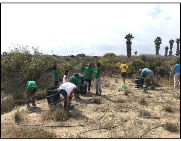
FIGURE 2. RESTORATION EVENTS BETWEEN AUGUST AND OCTOBER