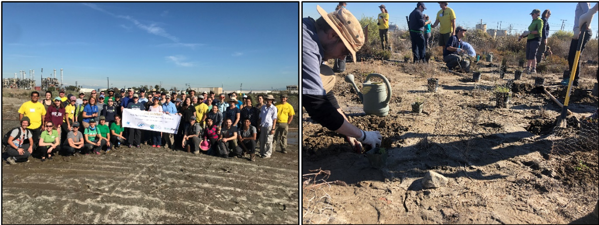
FIGURE 3. RESTORE AMERICA'S ESTUARIES EVENT

Los Cerritos Wetlands Stewardship Program Summary Report October 20th, 2018 – January 18th, 2019 |