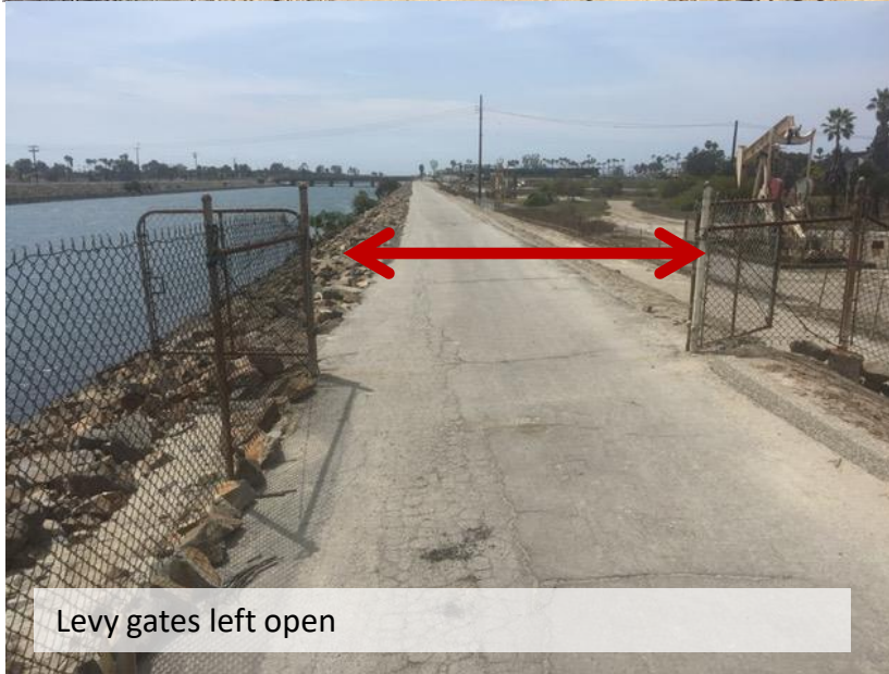
Levy gates left open