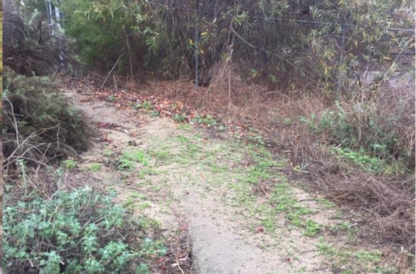
Nonnative germination along back trails