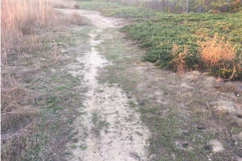
Nonnative germination along trails