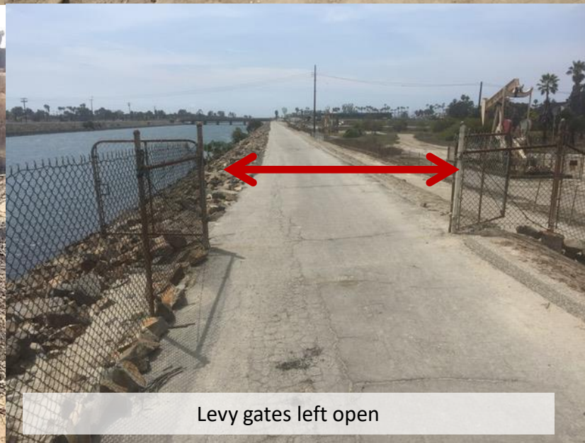
Levy gates left open