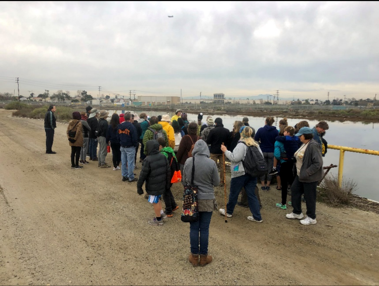
FIGURE 1. RAPTOR RAMBLE (TOP), HERON HIKE (MIDDLE), TURTLE TREK (BOTTOM)