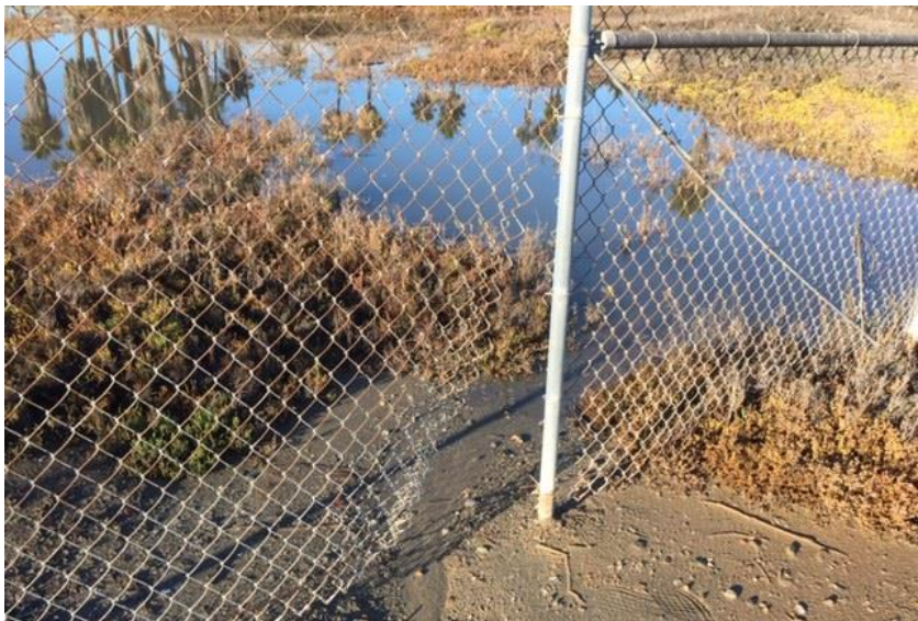
Breach in fenceline near main entrance gate