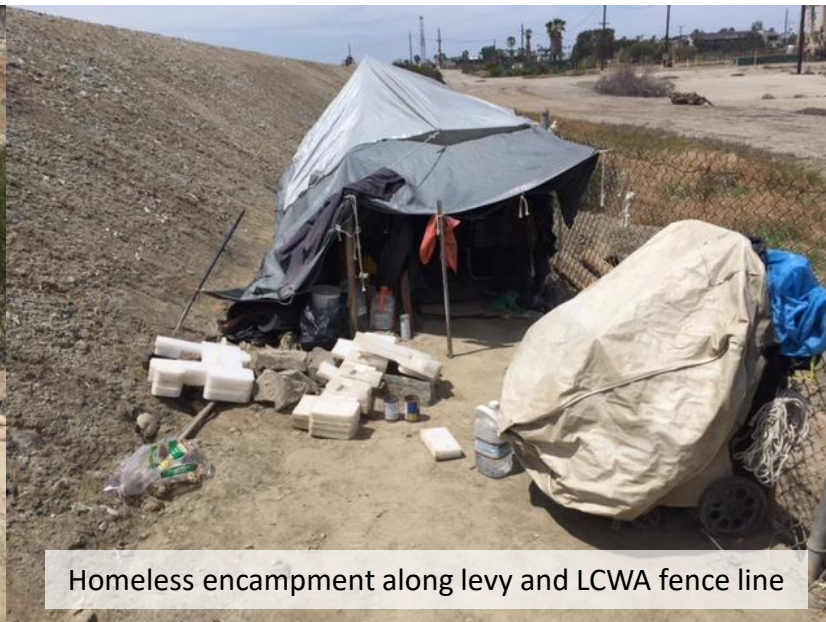
Homeless encampment along levy and LCWA fence line