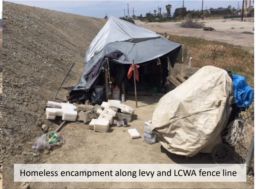
Homeless encampment along levy and LCWA fence line