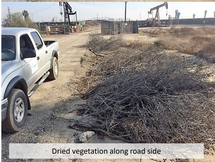
Dried vegetation along road side