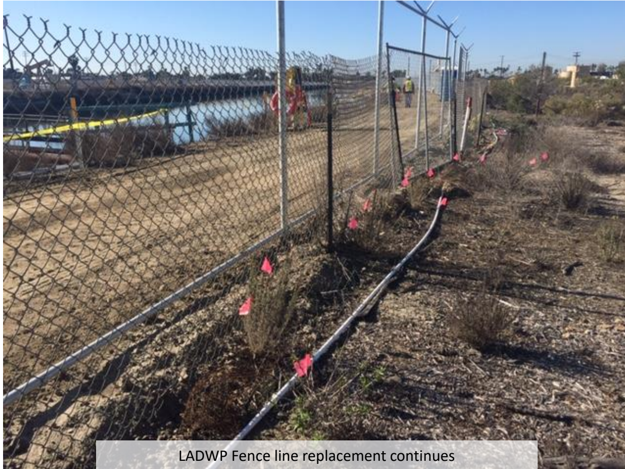
LADWP Fence line replacement continues