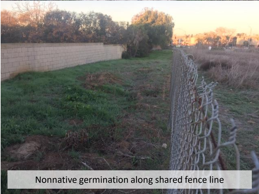
Nonnative germination along shared fence line