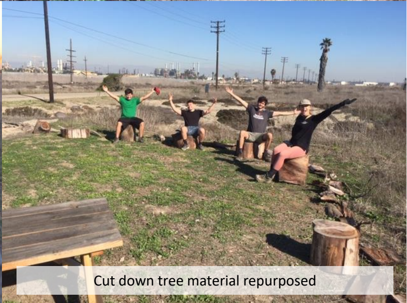
Cut down tree material repurposed