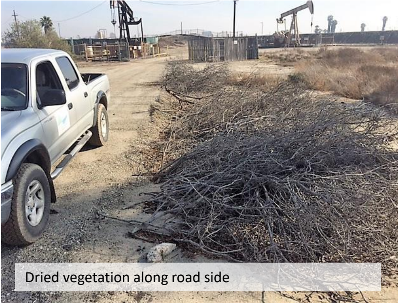
Dried vegetation along road side