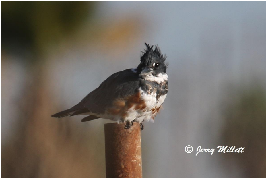
Belted Kingfisher ( Megaceryle alcyon )