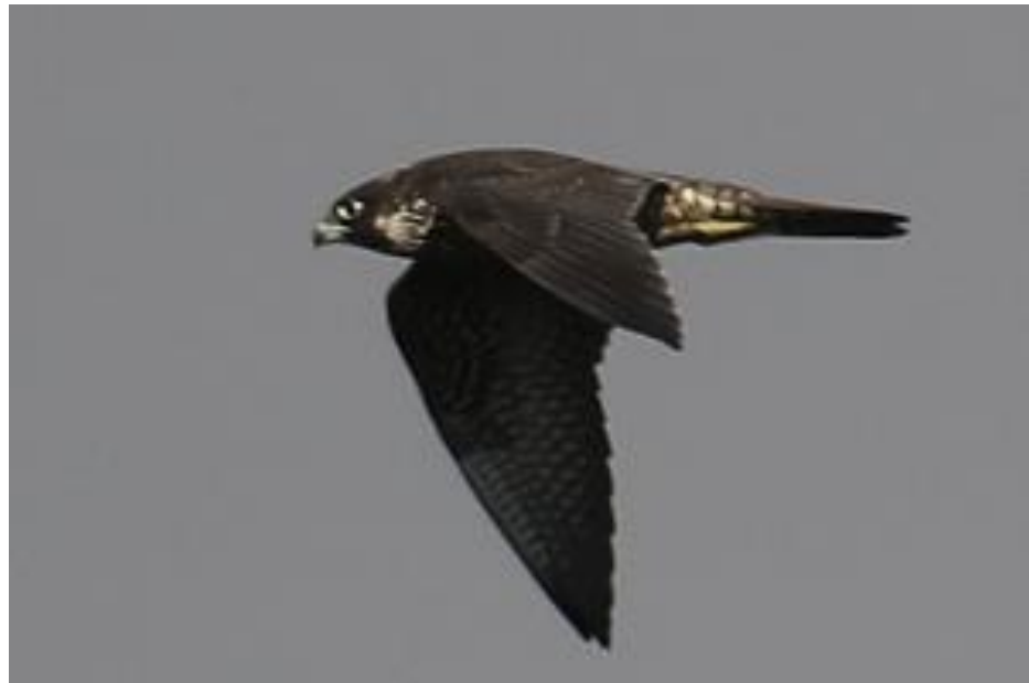
Perigrine Falcon ( Falco peregrinus )