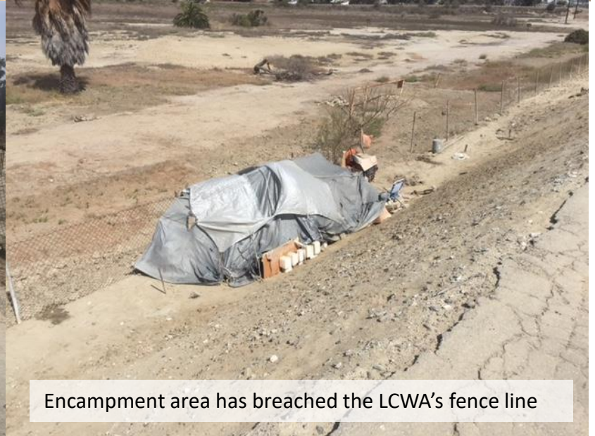
Encampment area has breached the LCWA's fence line