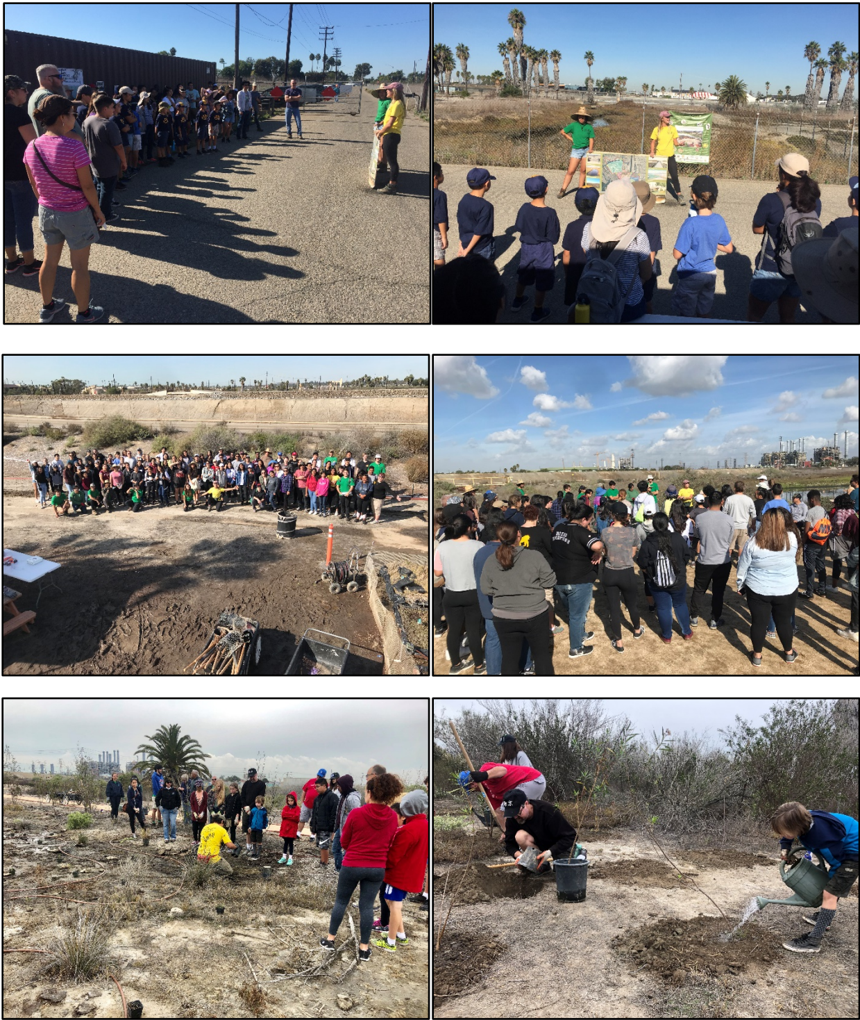
FIGURE 2. RESTORATION EVENTS BETWEEN AUGUST AND OCTOBER

Los Cerritos Wetlands Stewardship Program Summary Report October 20th, 2018 – January 18th, 2019 |