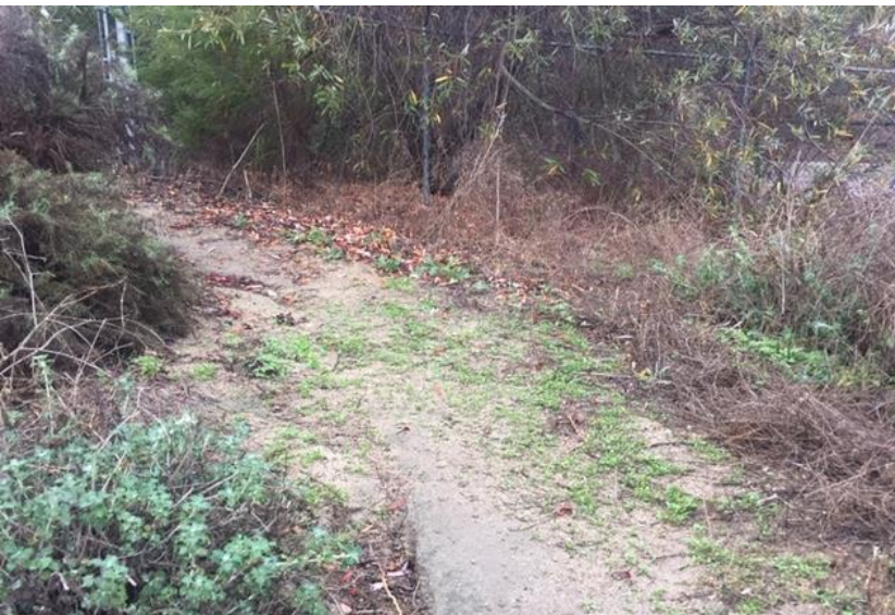
Seedlings sprouting up along trails