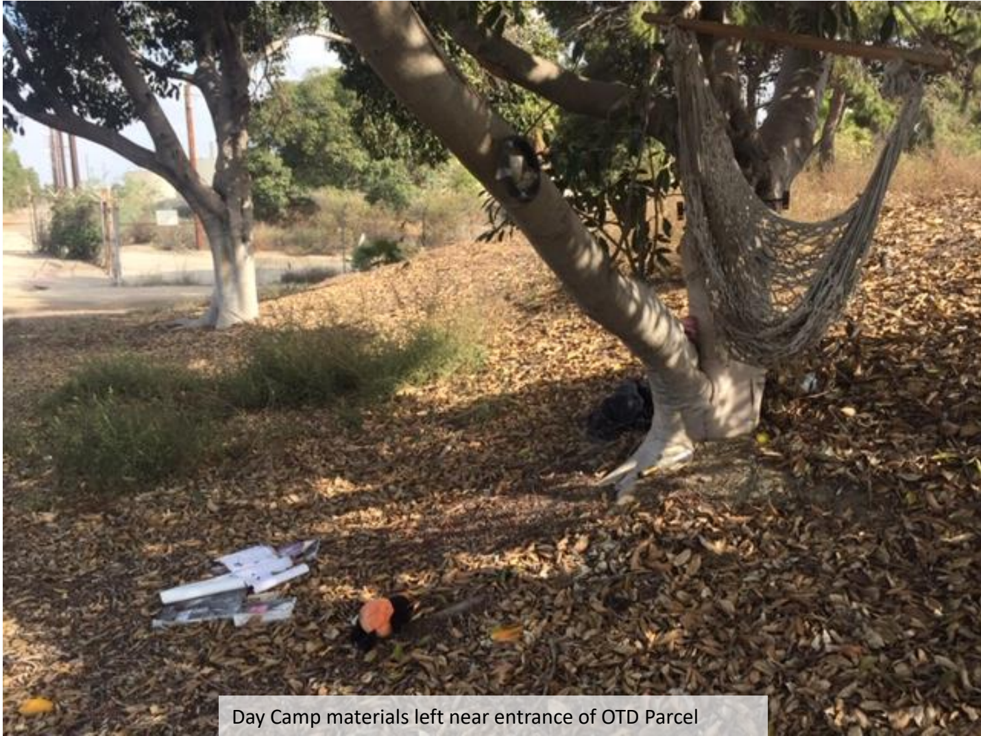
Day Camp materials left near entrance of OTD Parcel