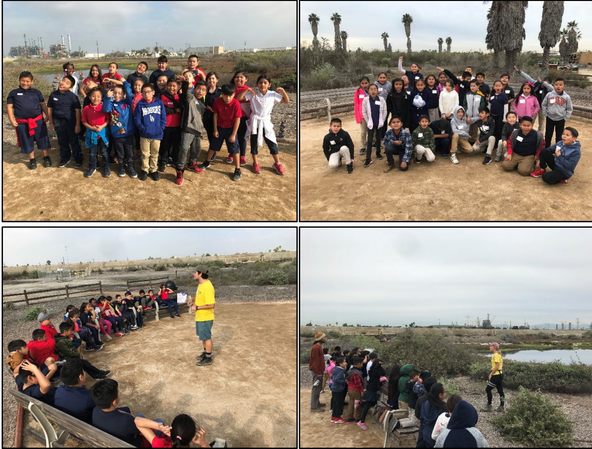
FIGURE 5. EXPLORE THE COAST PROGRAM FIELD TRIPS