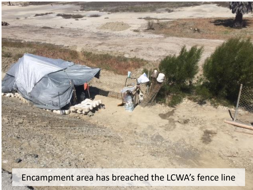
Encampment area has breached the LCWA's fence line