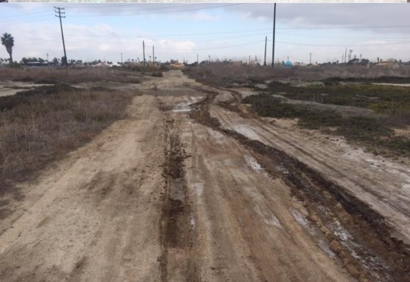
Tire tracks found along muddy roads