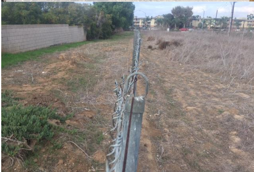
Seedlings beginning to sprout up along shared fenceline