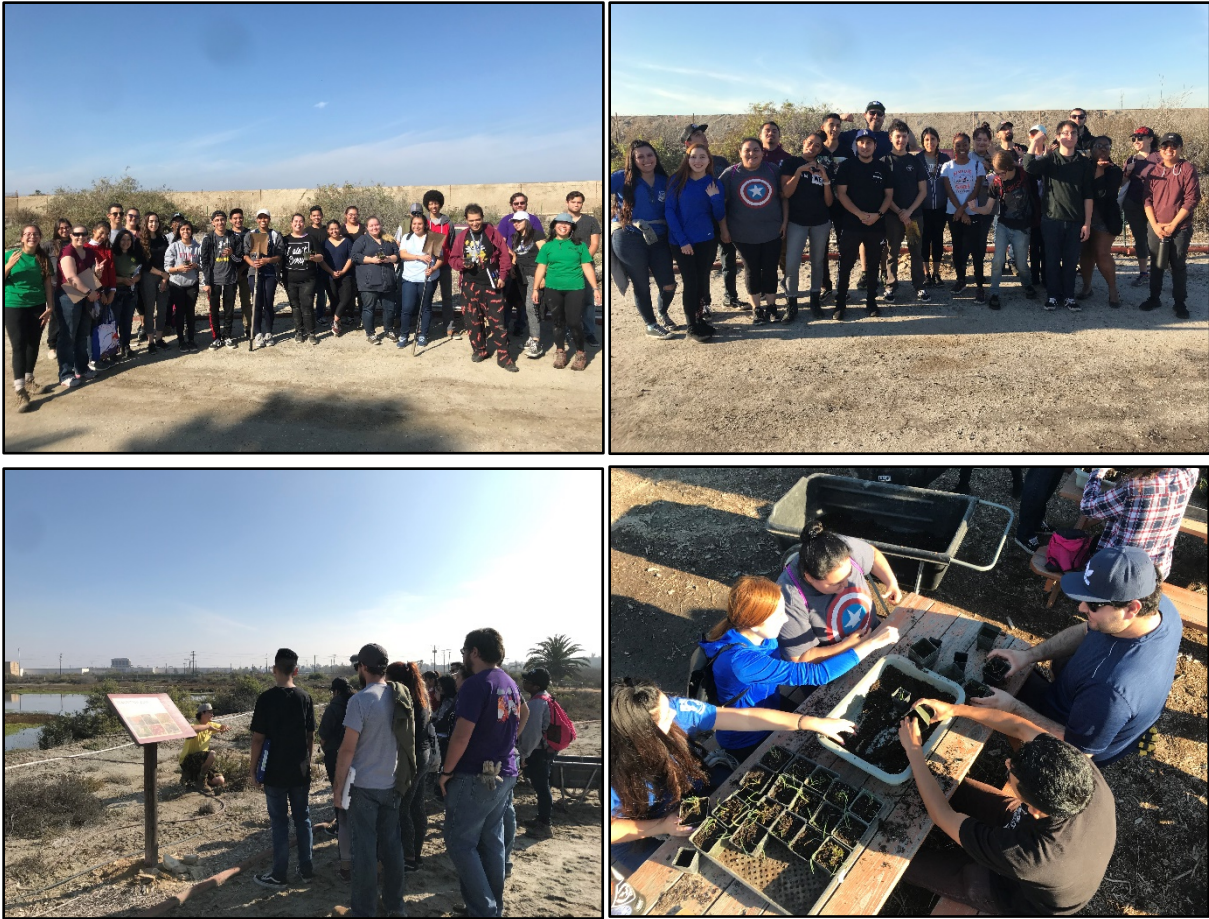
FIGURE 4. LBCC MARINE BIOLOGY CLASSES