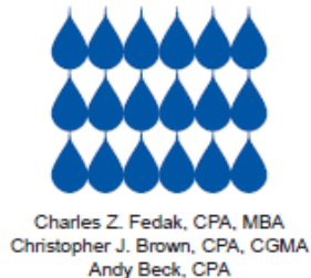
Exhibit A Fedak & Brown LLP Certified Public Accountants

Cypress Office: 6081 Orange Avenue Cypress, California 90630 (657) 214-2307 FAX (714) 527-9154