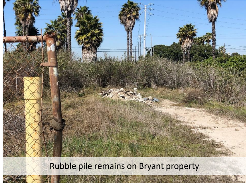
Rubble pile remains on Bryant property