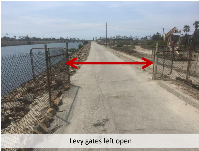
Levy gates left open