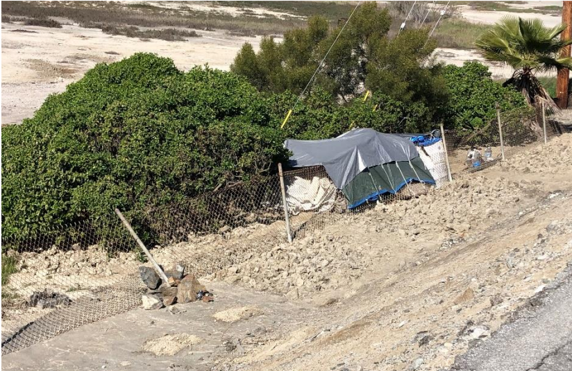
Encampment persists along eastern fence line