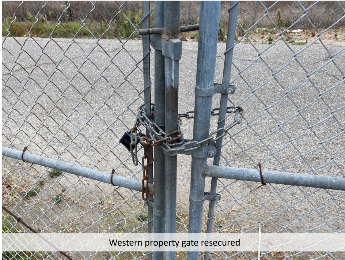
Western property gate resecured