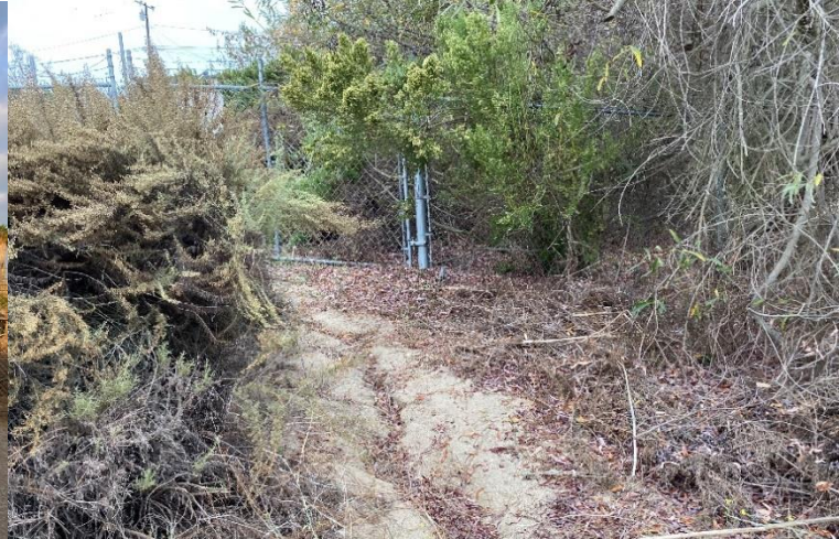
Erosion along back trail