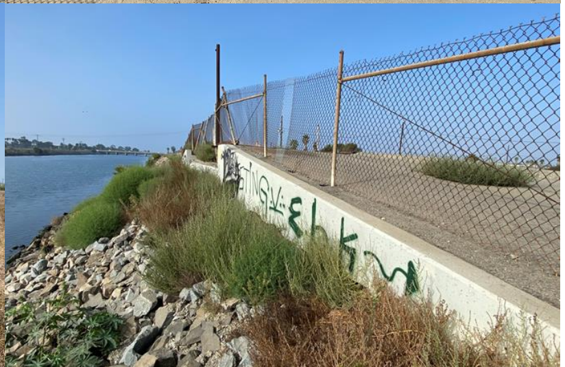
Graffiti on levee bank