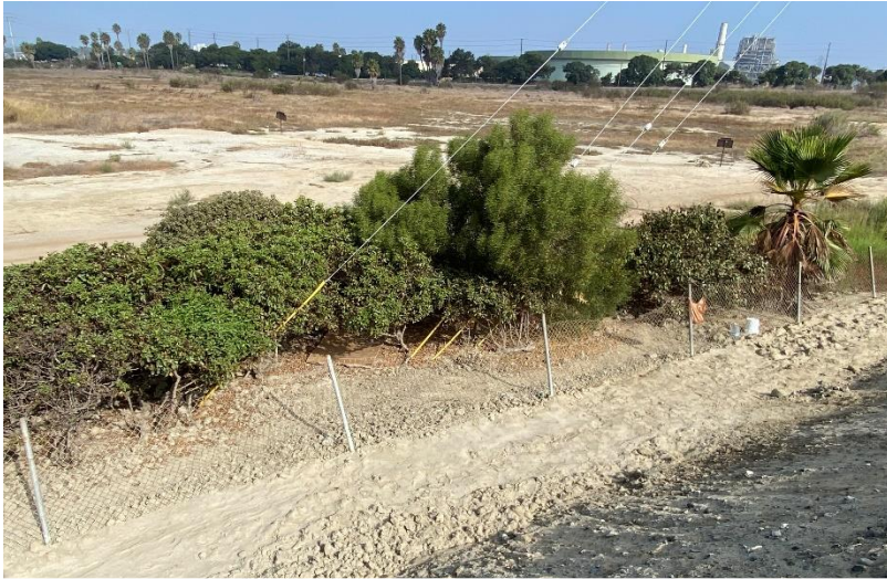
Main encampment clear of materials and vacated