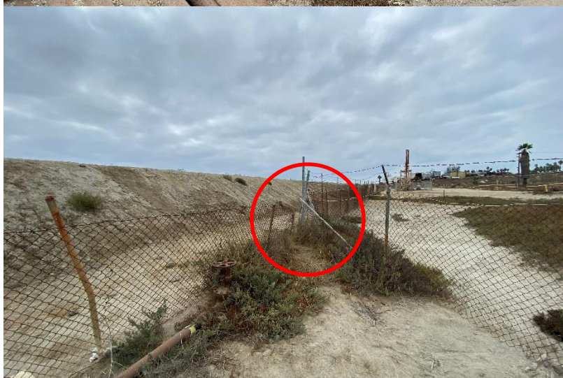
Southern border fence line breach