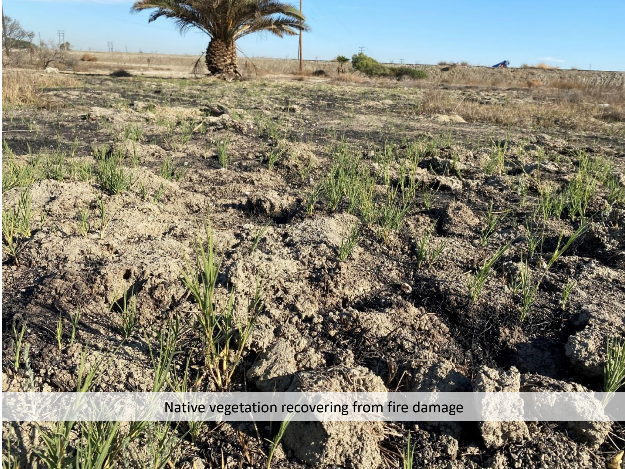
Native vegetation recovering from fire damage