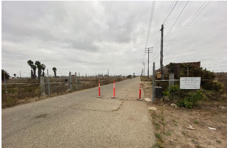
1 st and PCH entrance gate damaged by vehicle