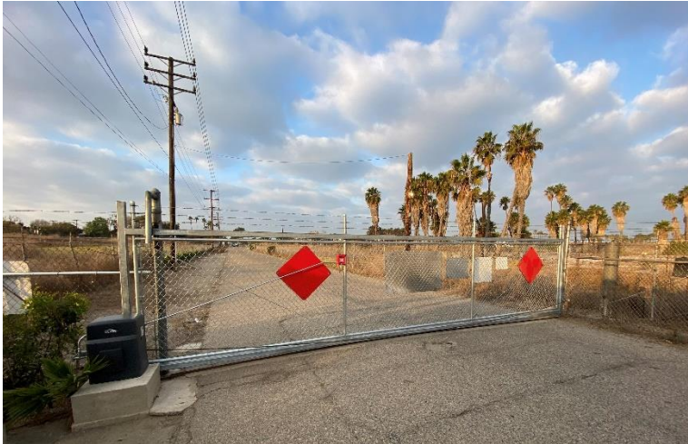
1 st and PCH entrance gate has been replaced