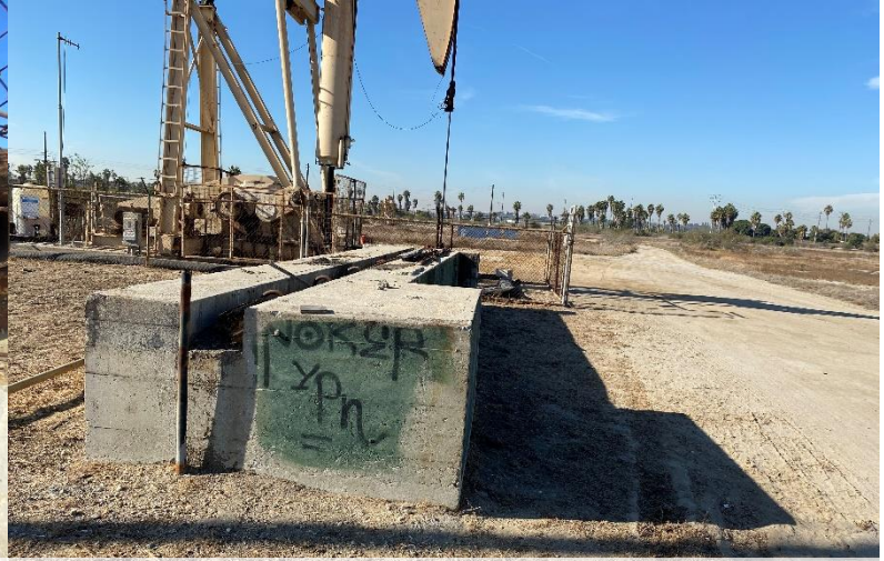
Graffiti on concrete structure