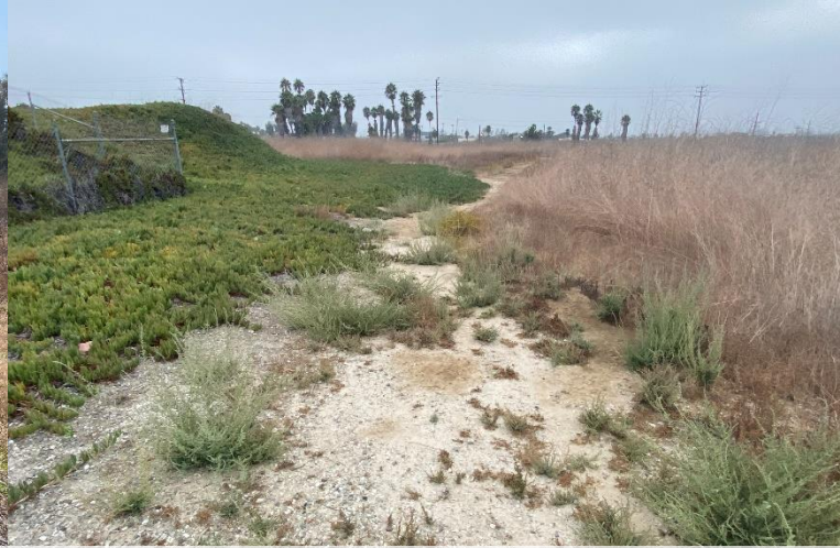
Vegetation growing along stewardship trail system