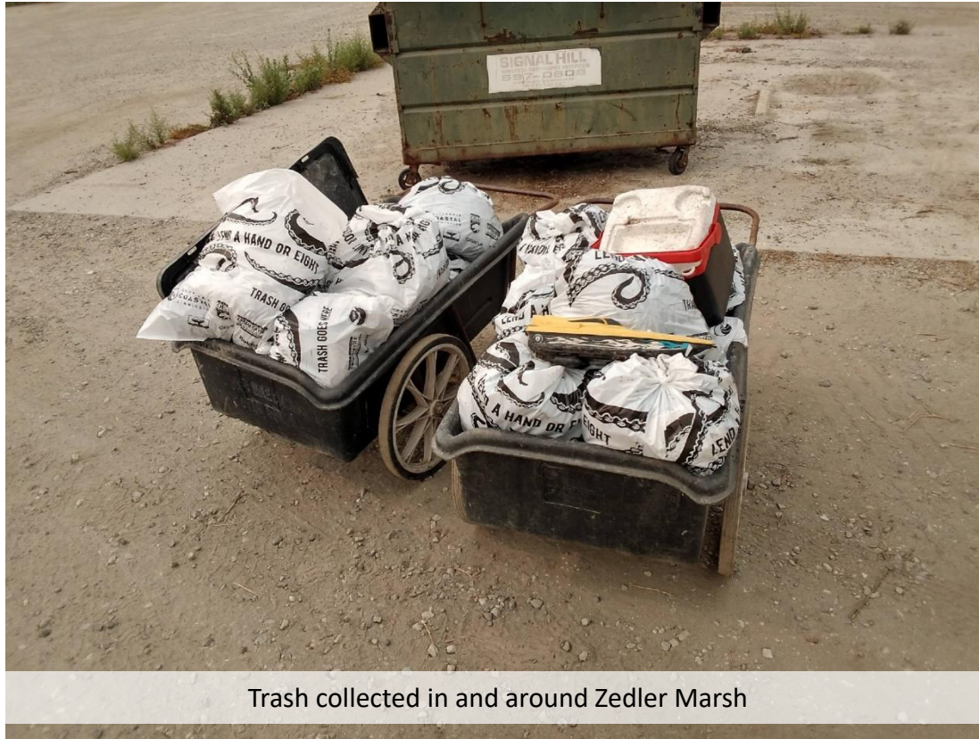
Trash collected in and around Zedler Marsh