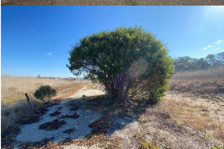
Non-native tree trimmed to allow line of sight visibility