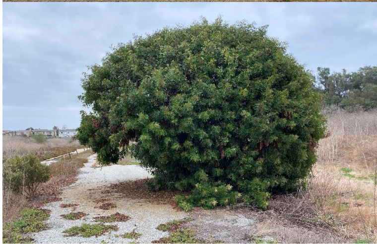
Non-native pepper tree growing onto trail