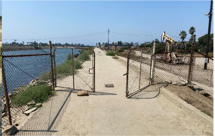
Levee gates left open