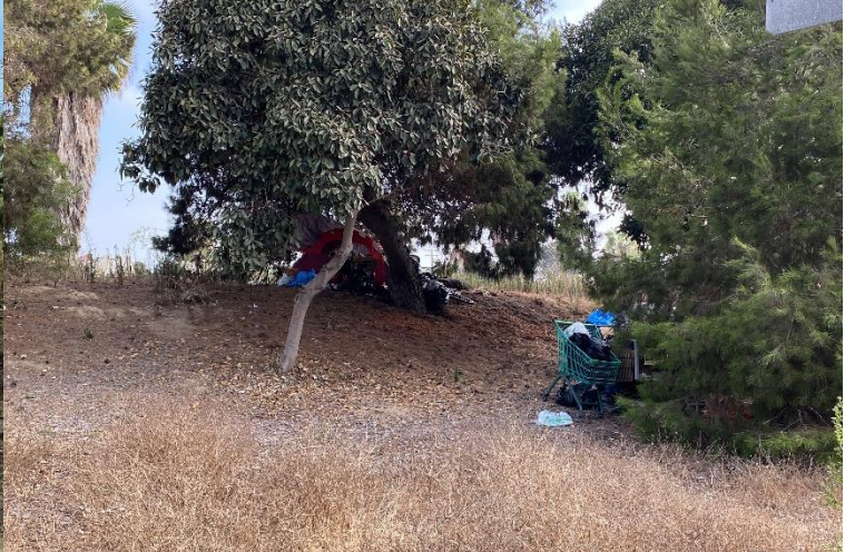
Encampment on southern property border