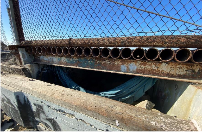
Bedding found underneath cattle grates