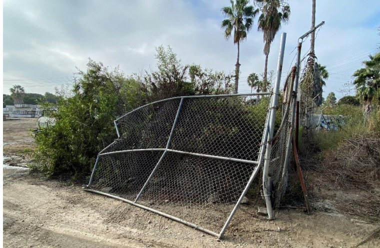
Entrance gate damaged by vehicle