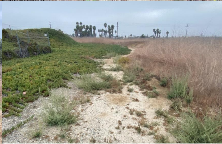
Vegetation growing along stewardship trail system