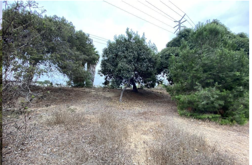
Encampment on southern property border remediated