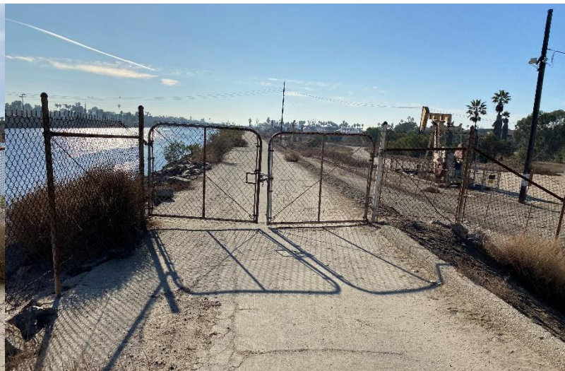
Levee gates remain locked