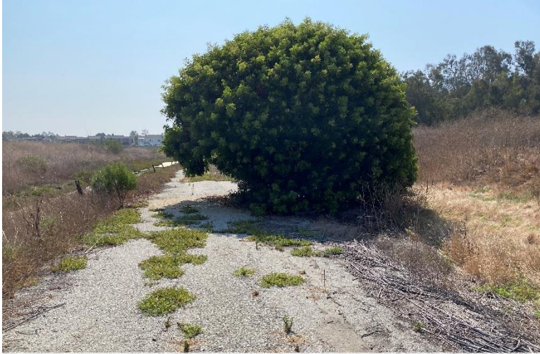
Non-native pepper tree growing onto trail