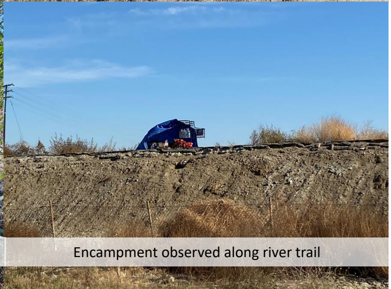
Encampment observed along river trail