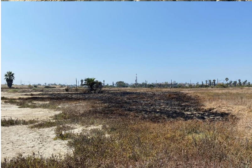
Small fire in north western section of property