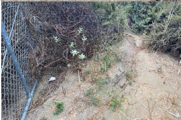
Erosion along back trail