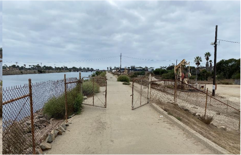
Levee gates left open