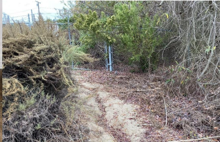
Erosion along back trail