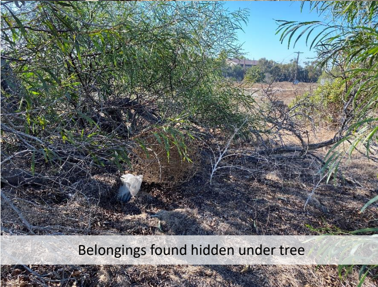
Belongings found hidden under tree