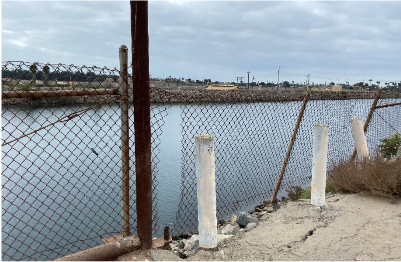
Levee bank fence breach