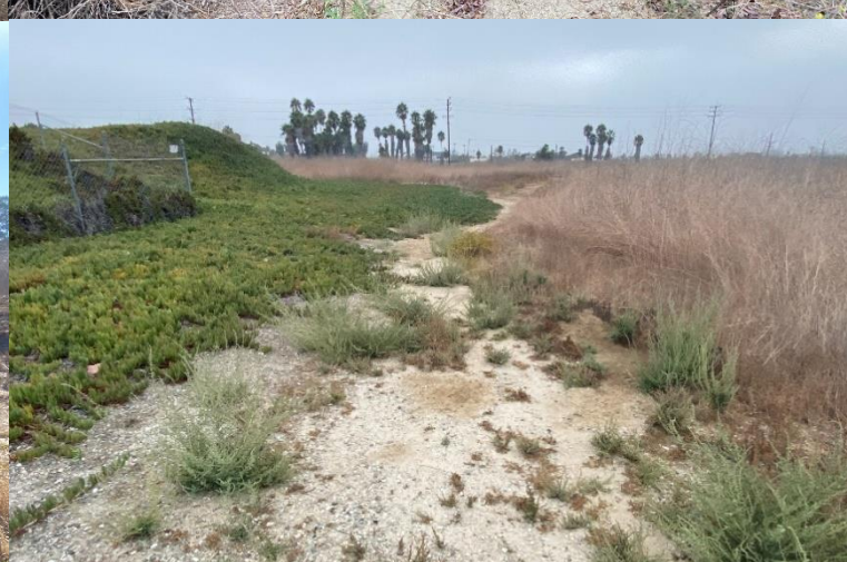
Vegetation growing along trail system