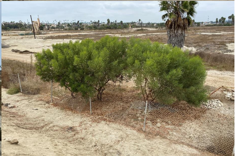
Eastern fence line breach near old encampment