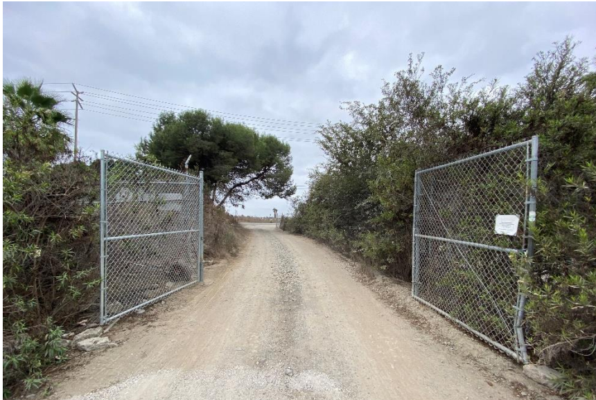
Entrance gate replaced