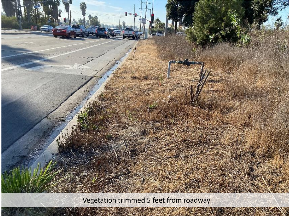
Vegetation trimmed 5 feet from roadway