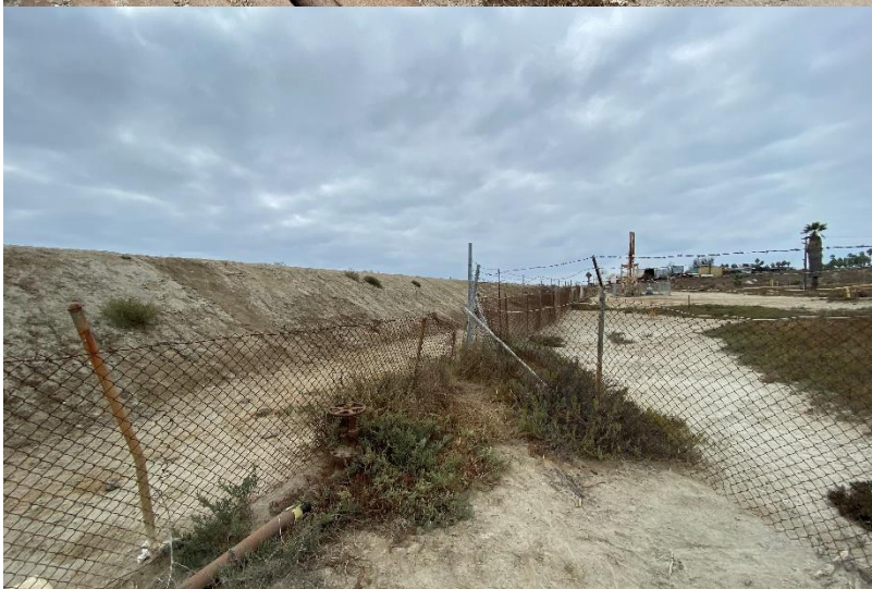
Southern border fence line breach