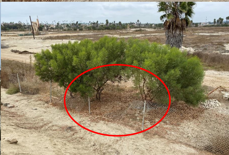
Eastern fence line breach near old encampment