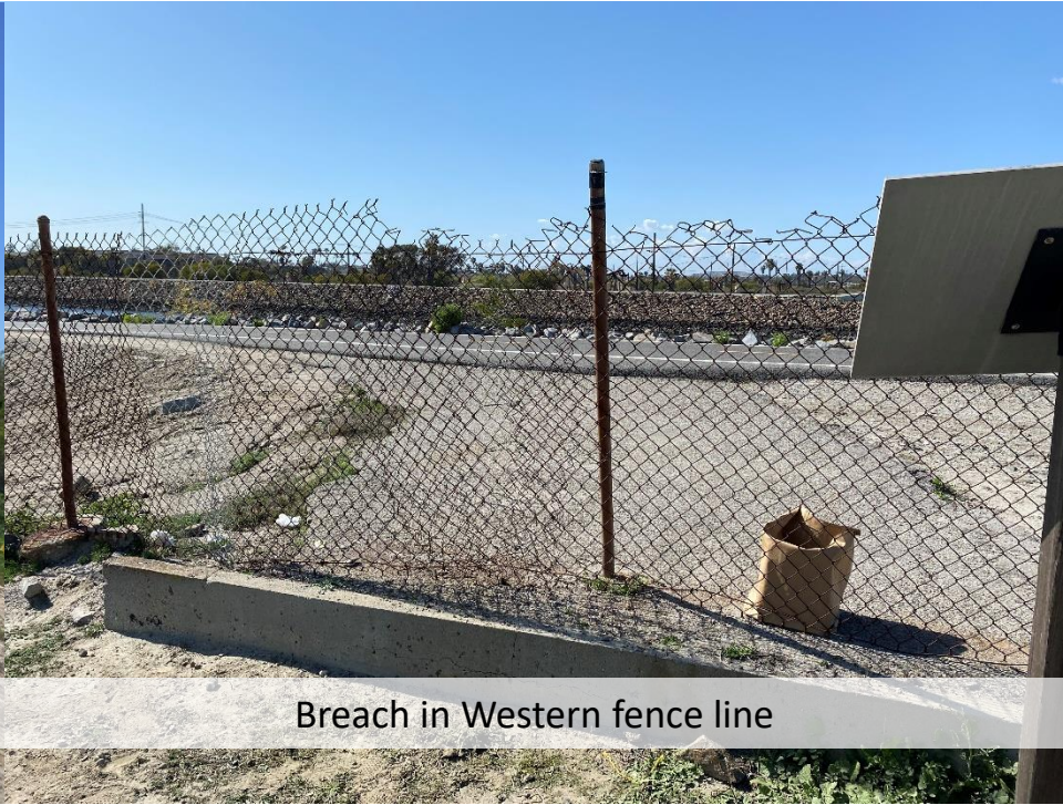
Breach in Western fence line