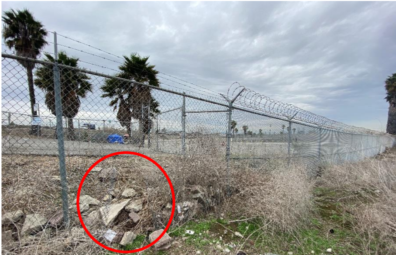
Breach in Southwestern fence line observed