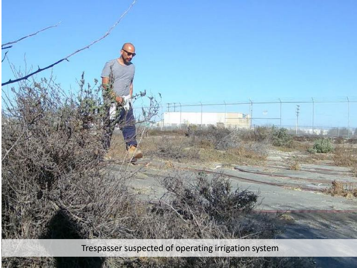
Trespasser suspected of operating irrigation system