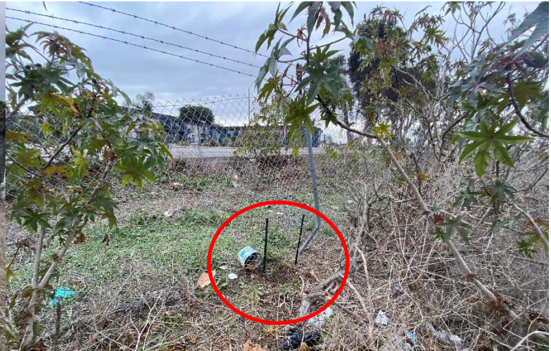
Breach in PCH fence line repaired