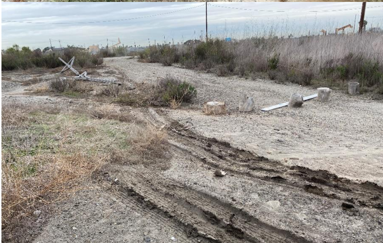
Ruts in dirt road and damaged vegetation