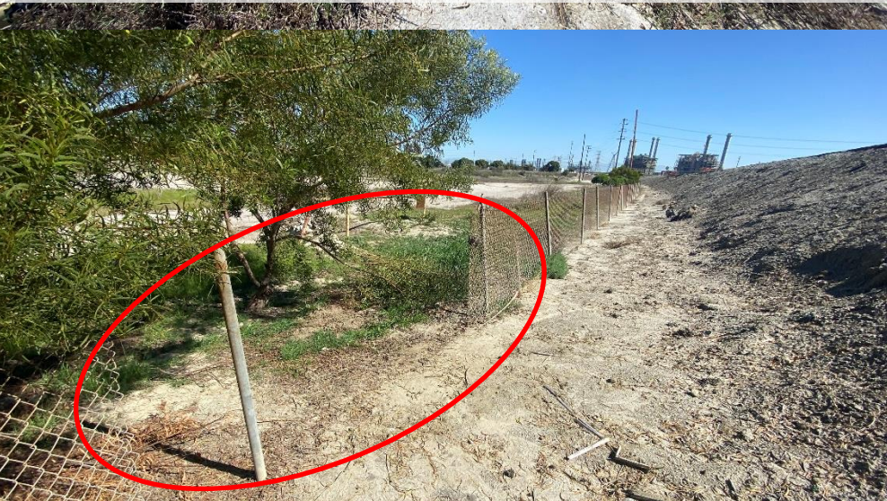
Fence breach along eastern fence line