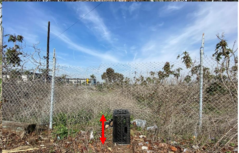
Liftable portions of fence line