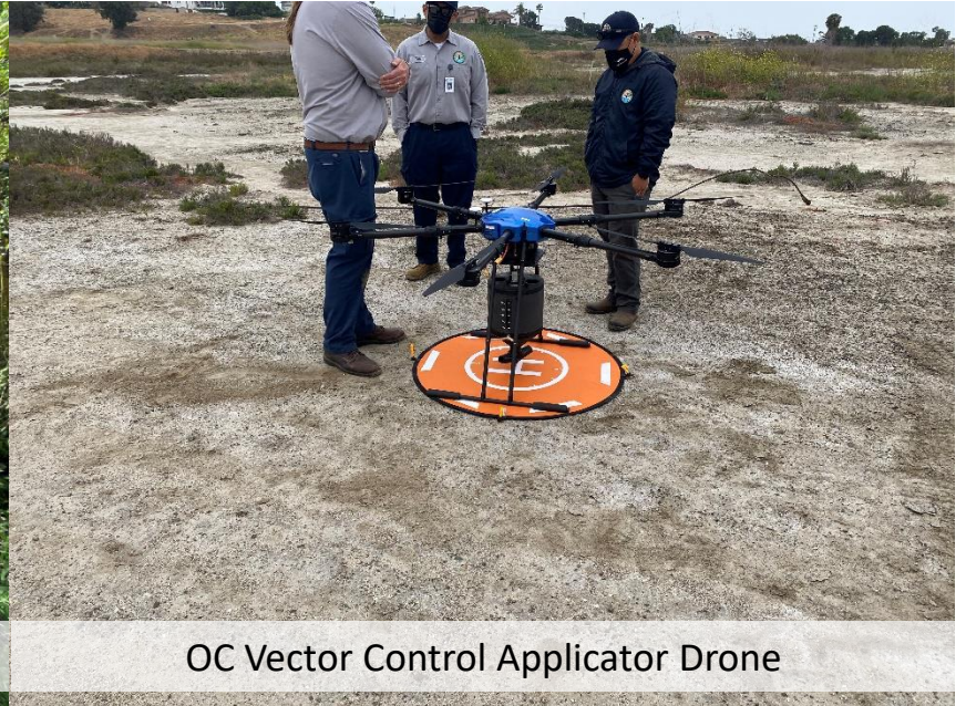
OC Vector Control Applicator Drone