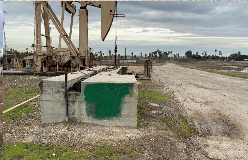
Graffiti on concrete structure remediated