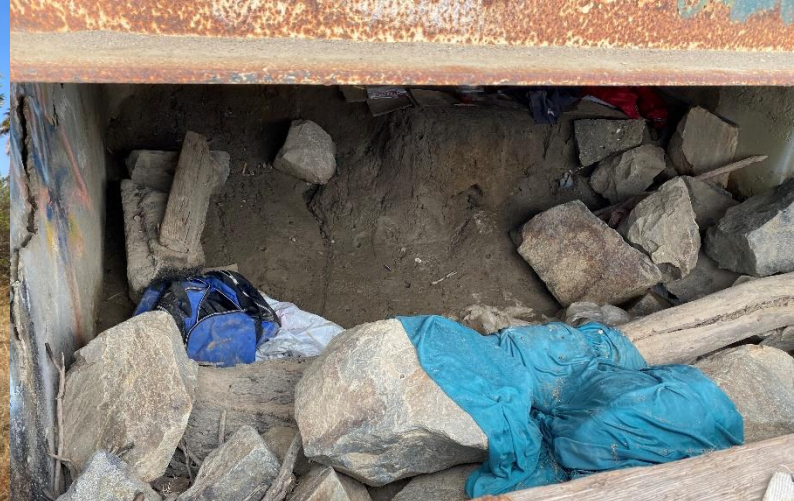
Bedding and materials below cattle grates