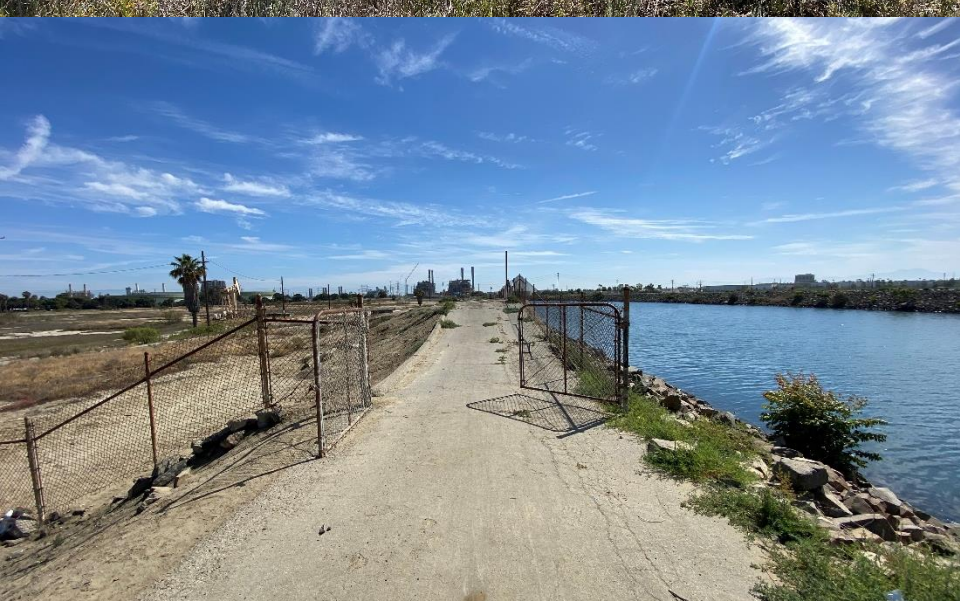
Levee gates open