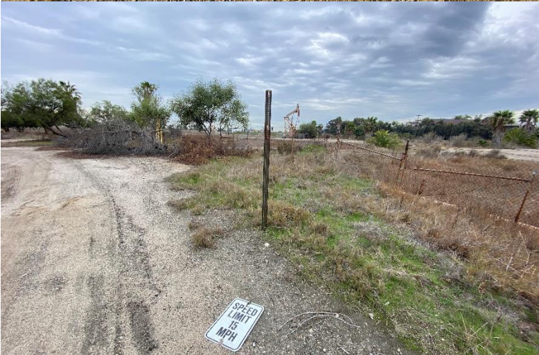
Damaged speed limit sign