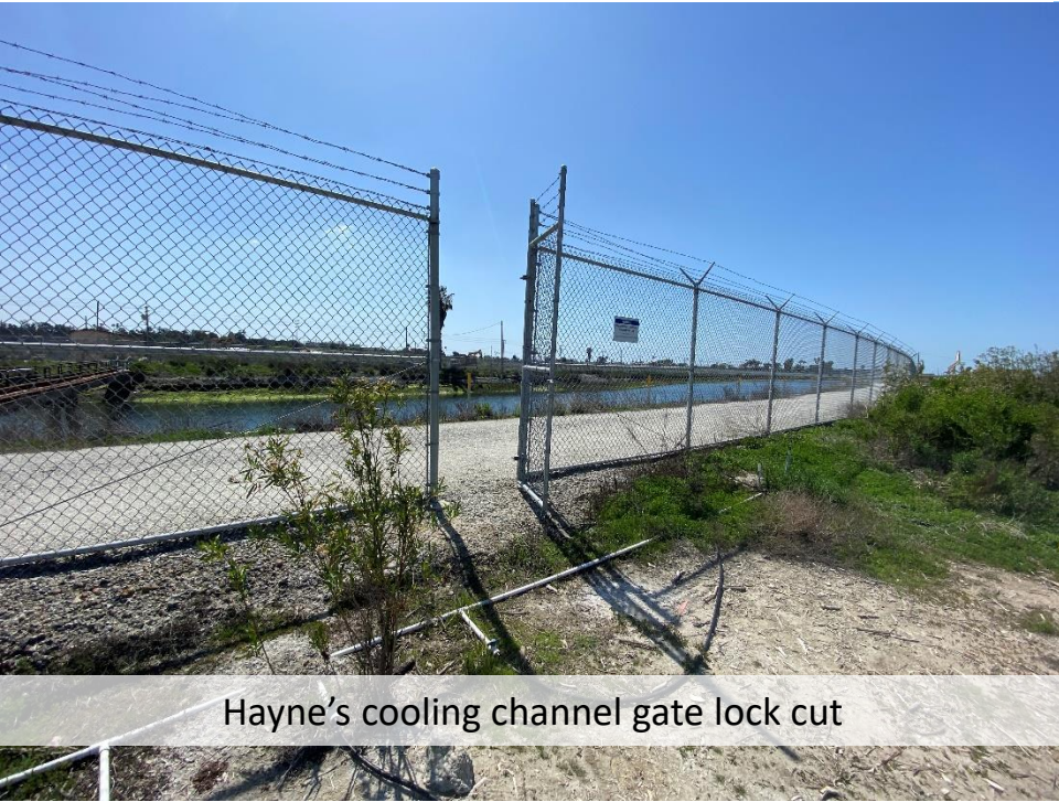
Hayne's cooling channel gate lock cut