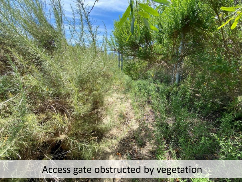
Access gate obstructed by vegetation