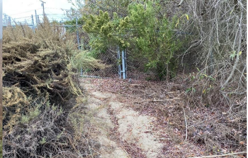
Erosion along back trail