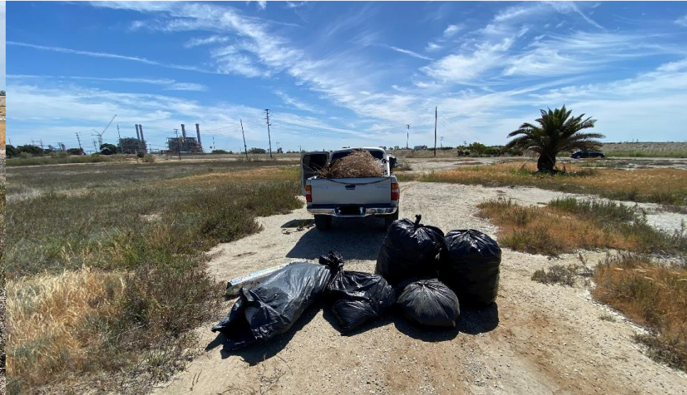
Trash bags removed from marsh vegetation