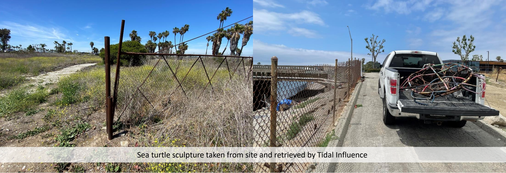
Sea turtle sculpture taken from site and retrieved by Tidal Influence