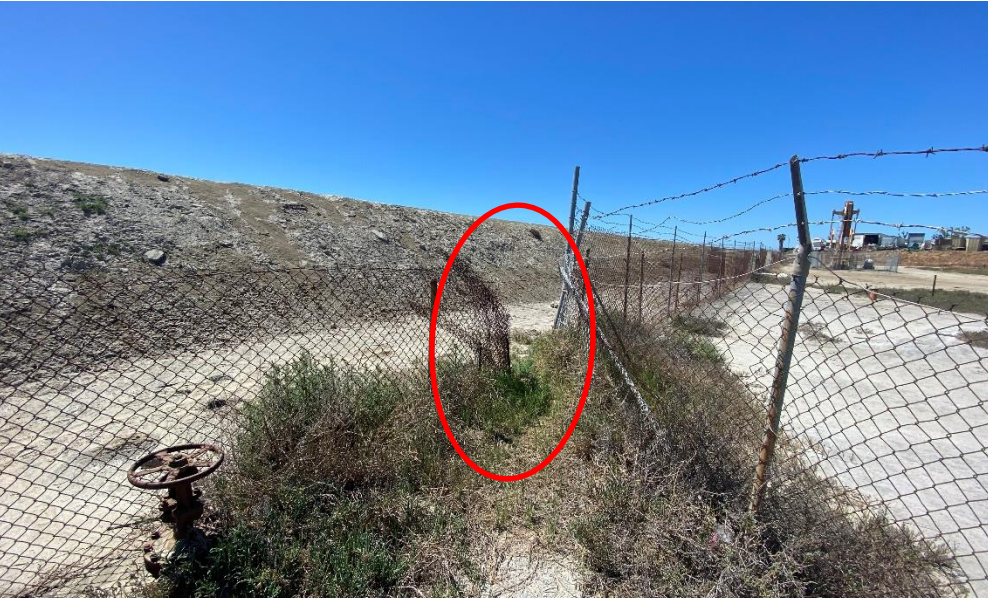
Fence breach in southeast corner of property