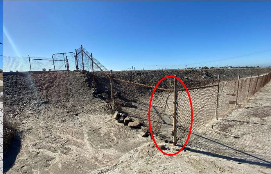
Fence breach near levee gates