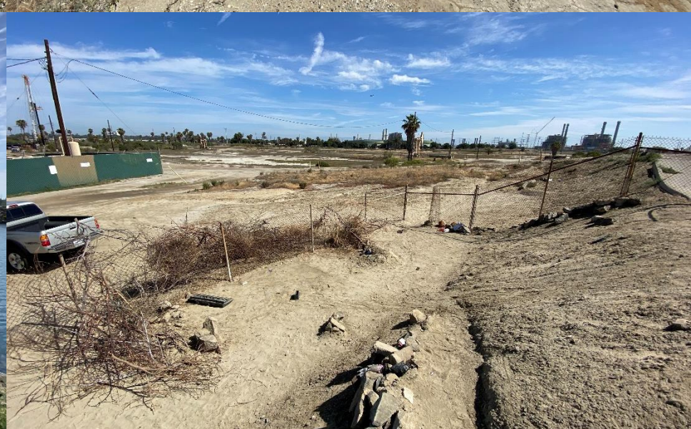
Encampment next to levee gates remediated