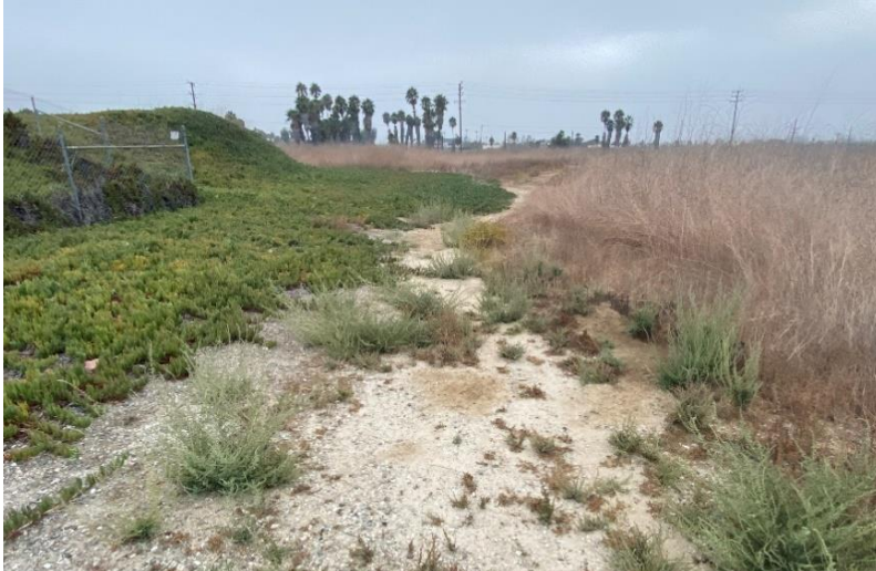
Non-native vegetation growing along trail system