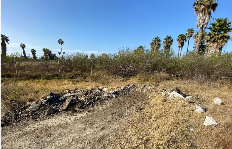
Sparsely vegetated ground where rubble pile stood