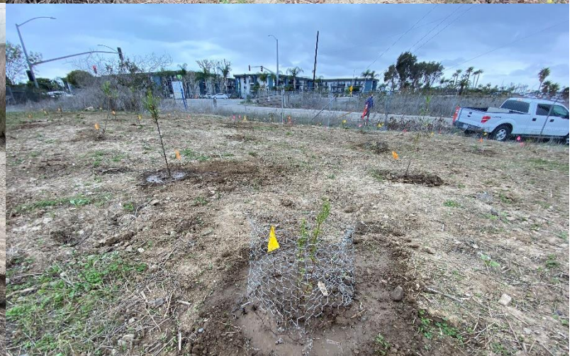
Native plants installed on site