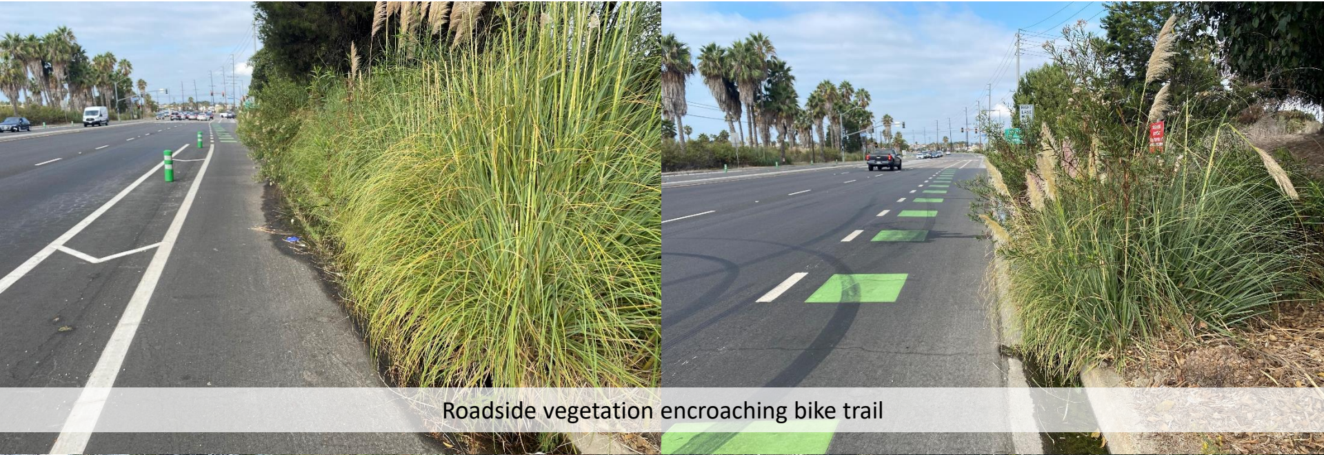
Roadside vegetation encroaching bike trail