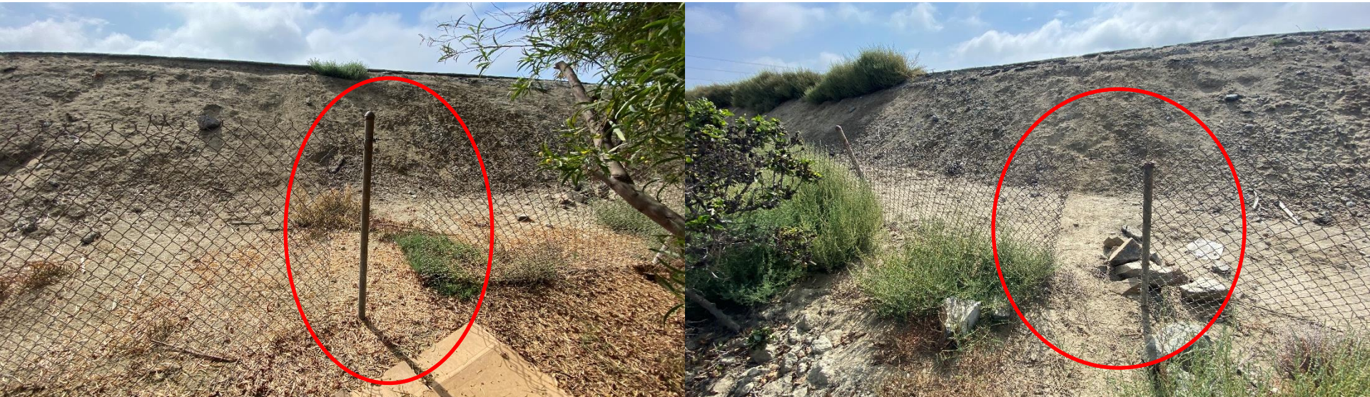
Eastern fence line breached