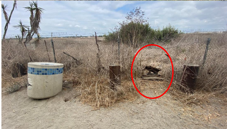
Gum Grove fence line breach