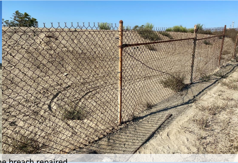
Western fence line breach repaired