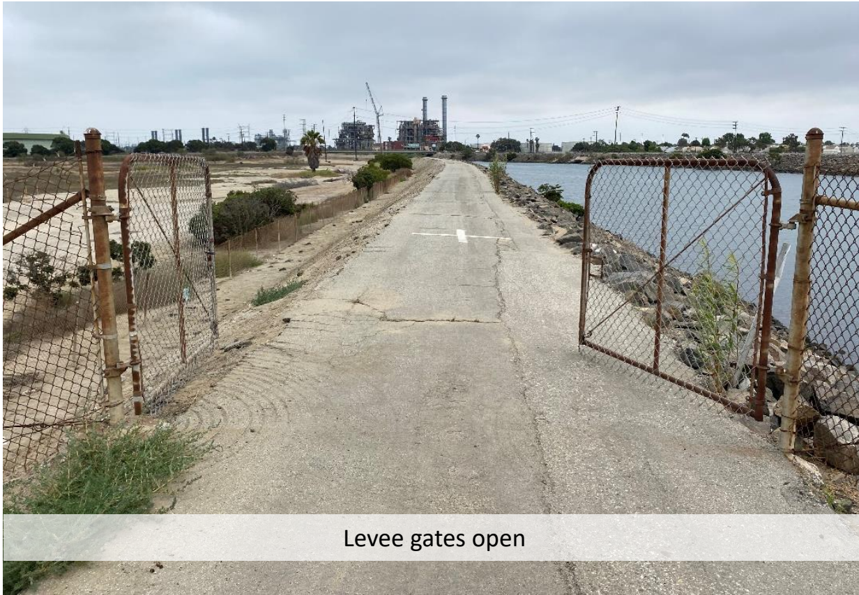
Levee gates open