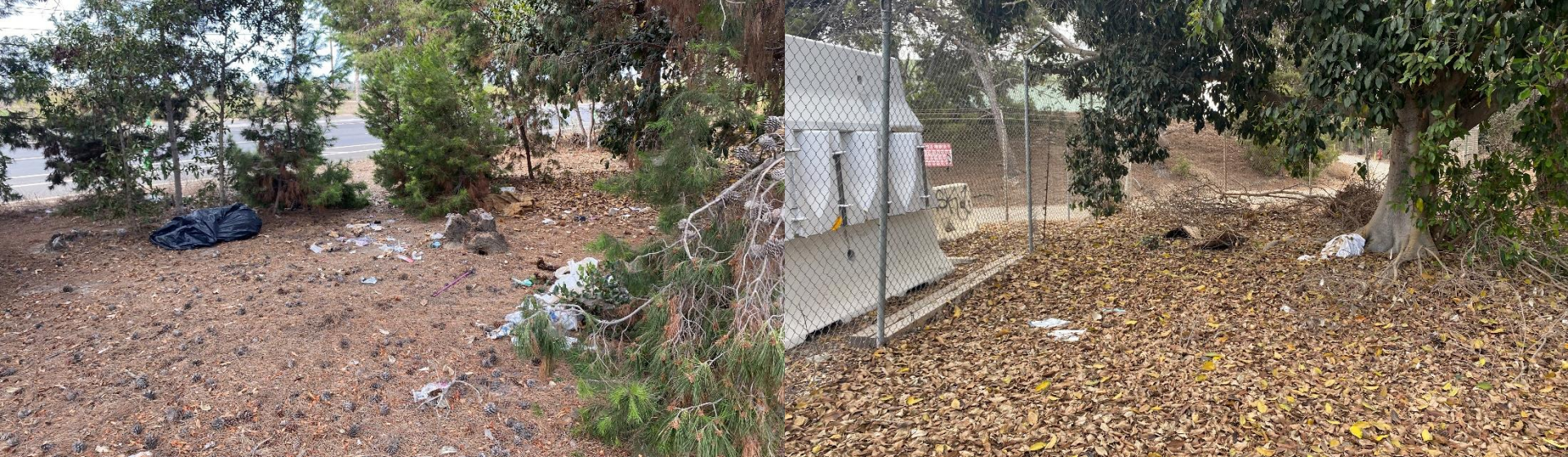
Trash accumulating on property perimeter