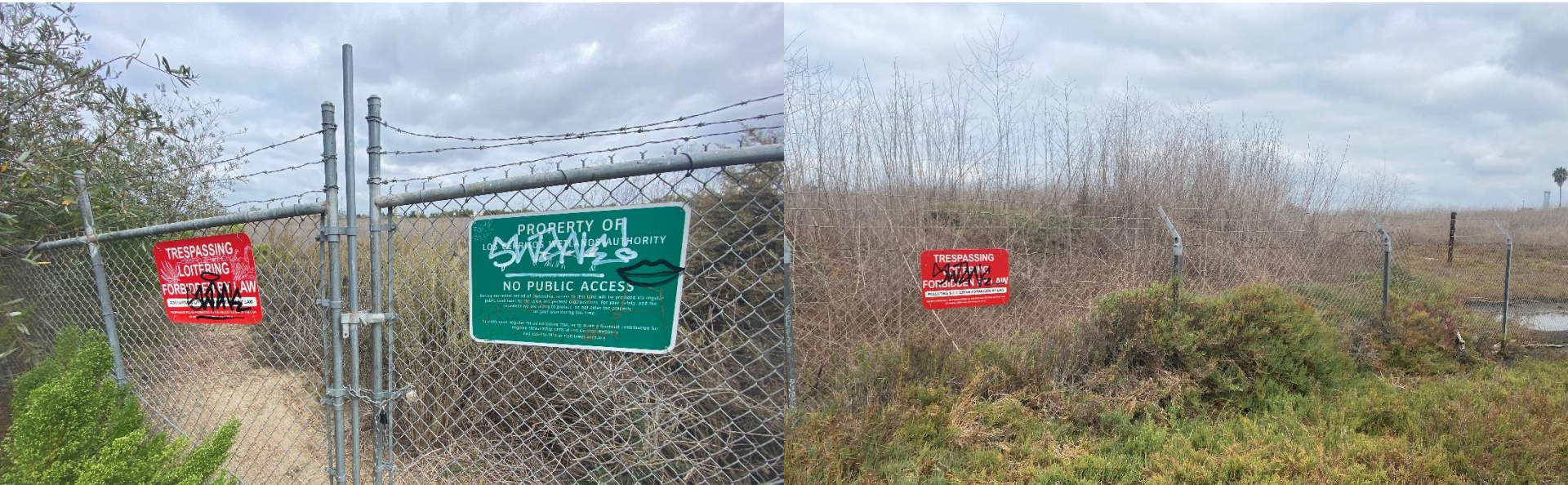
Graffiti on No Trespassing Signage