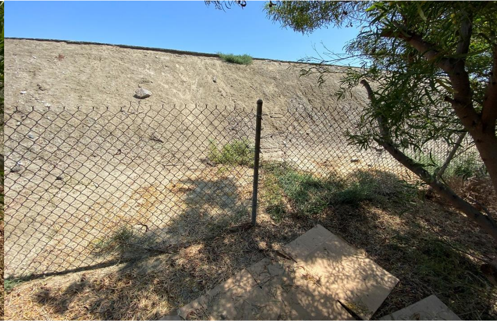
Repaired Eastern fence line breached