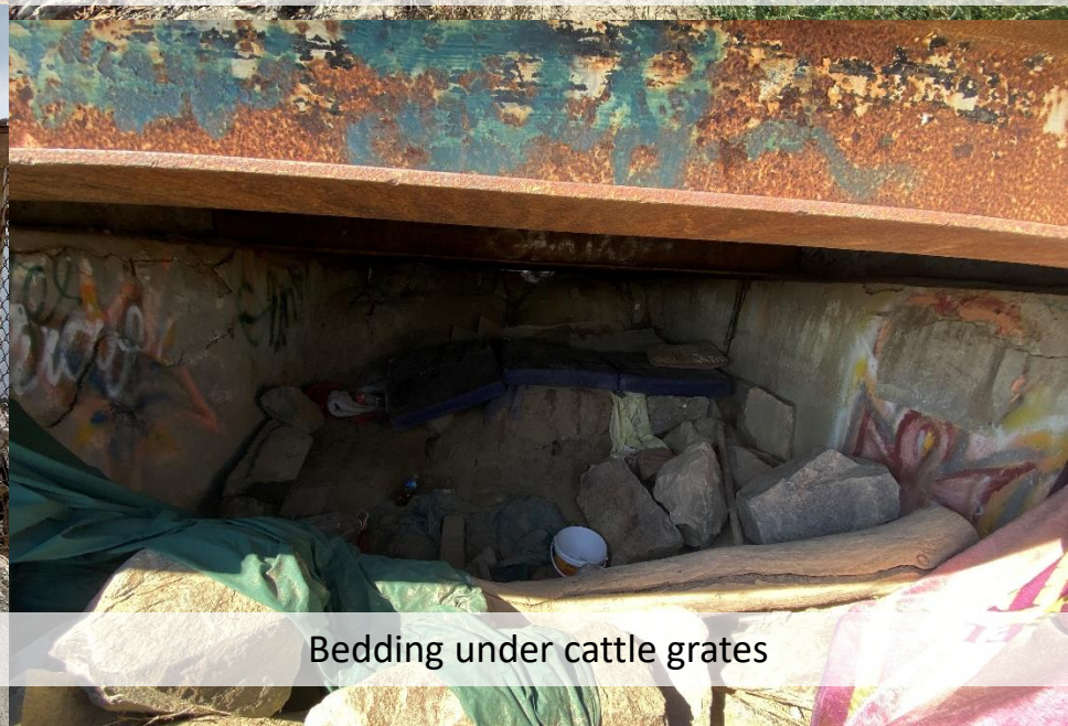
Bedding under cattle grates