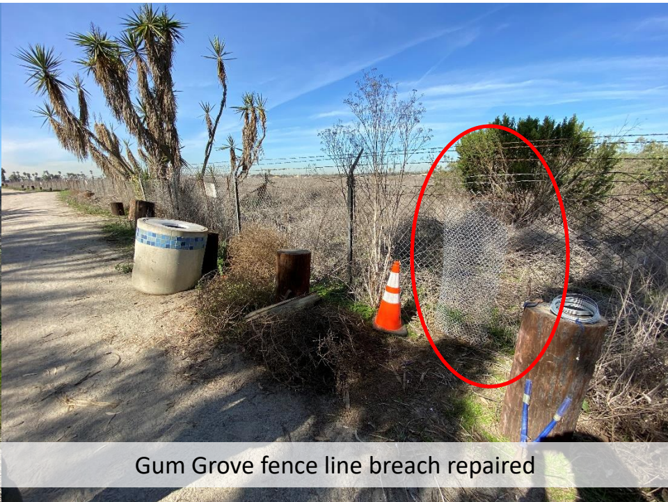
Gum Grove fence line breach repaired