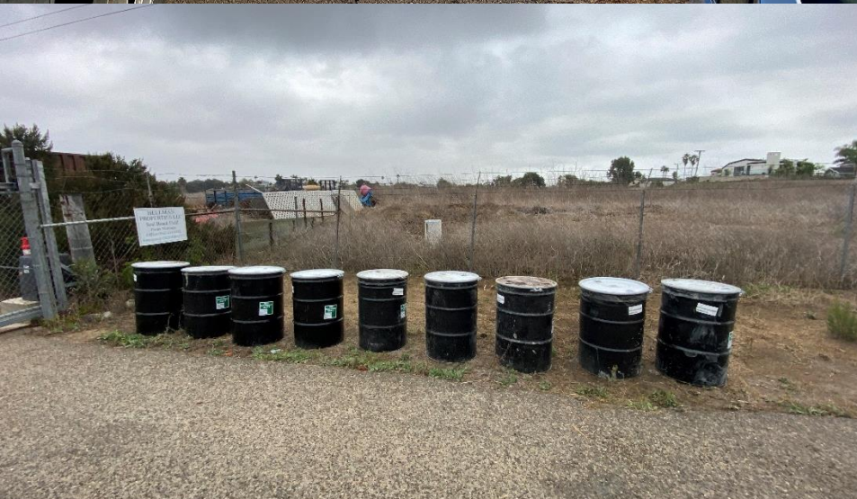
Excess soil staged for removal