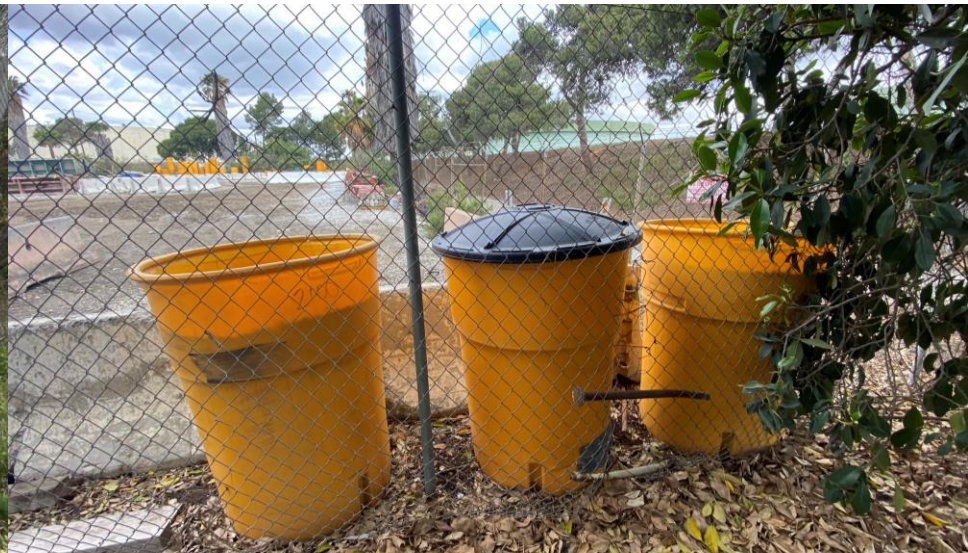
Southern fence line breaches reenforced by lessee