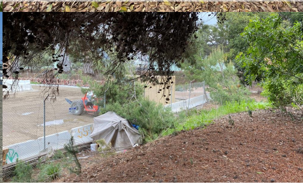
Encampment along southern fence line