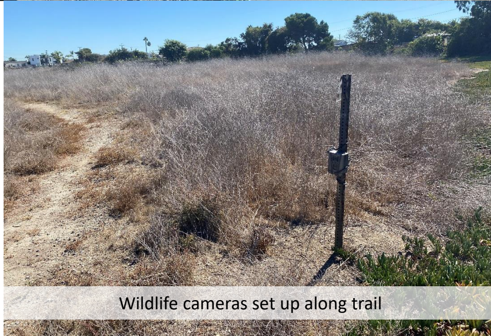
Wildlife cameras set up along trail