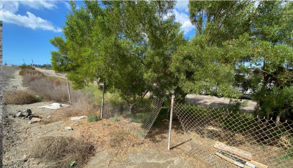
Breaches along eastern fence line