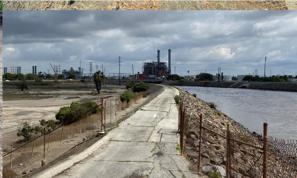
Levee gates found open