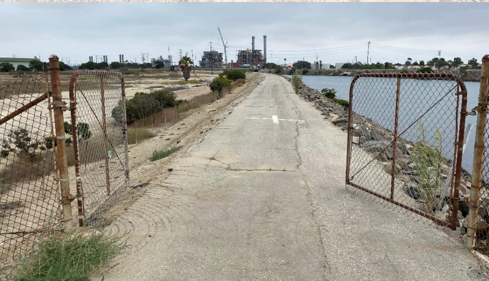
Levee gates open