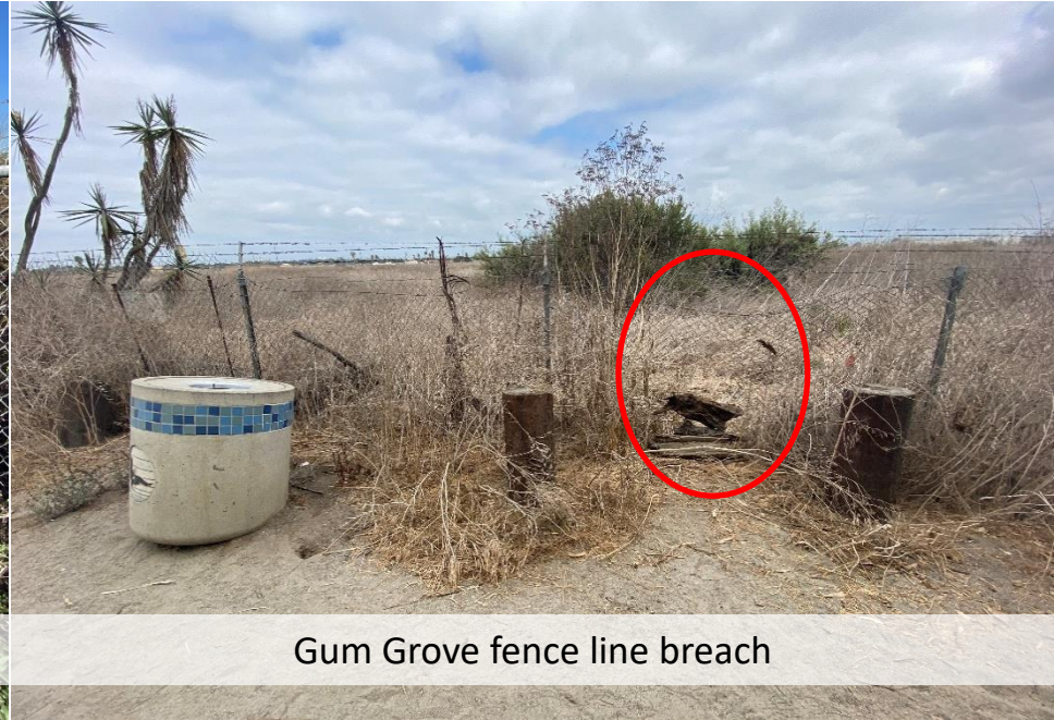
Gum Grove fence line breach