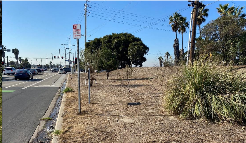
Vegetative maintenance performed