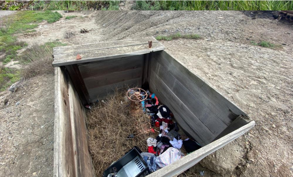
Trash build up around cattle grate facilities