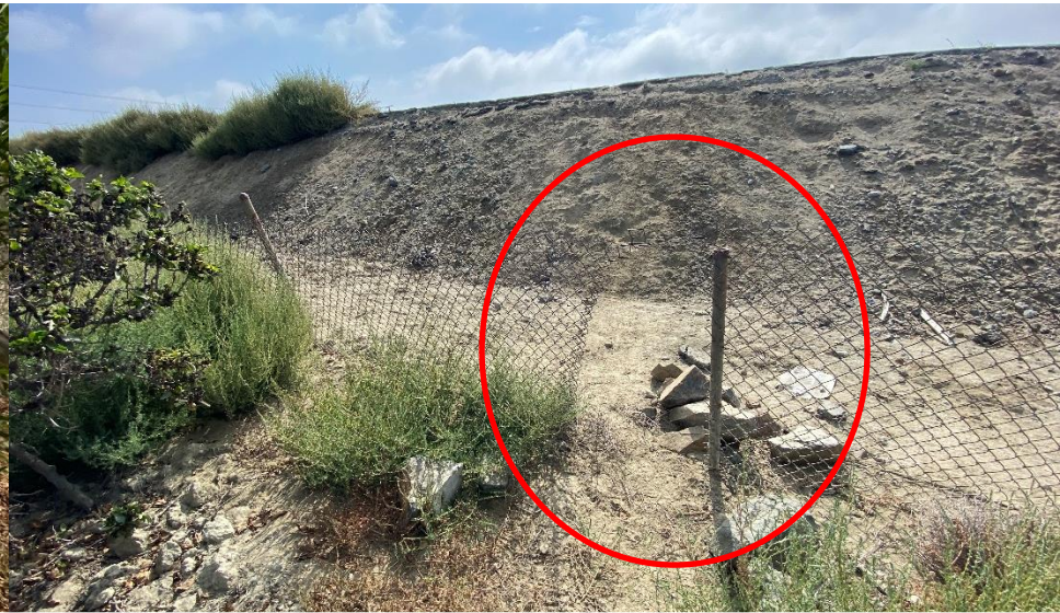
Eastern fence line breached