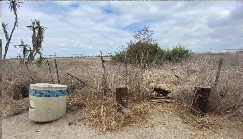
Gum Grove fence line breach