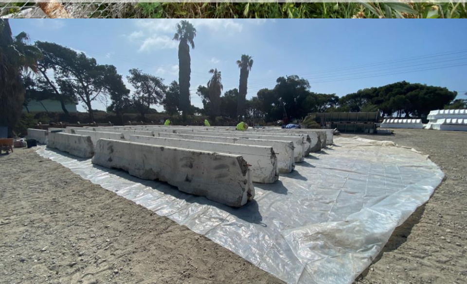
K-rails stored on site