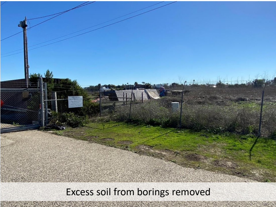
Excess soil from borings removed