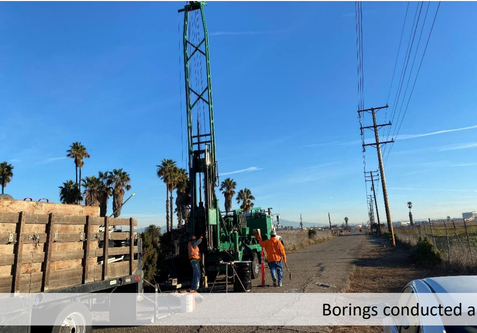
Borings conducted along road and refilled