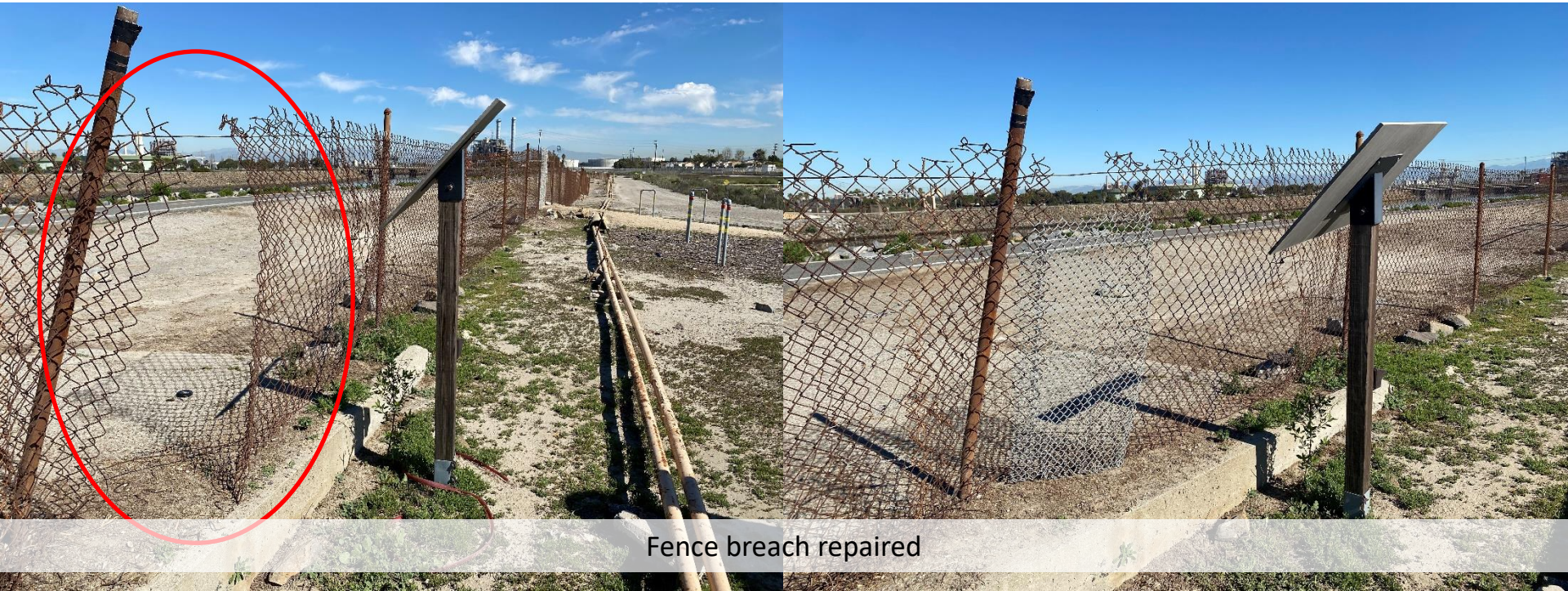
Fence breach repaired