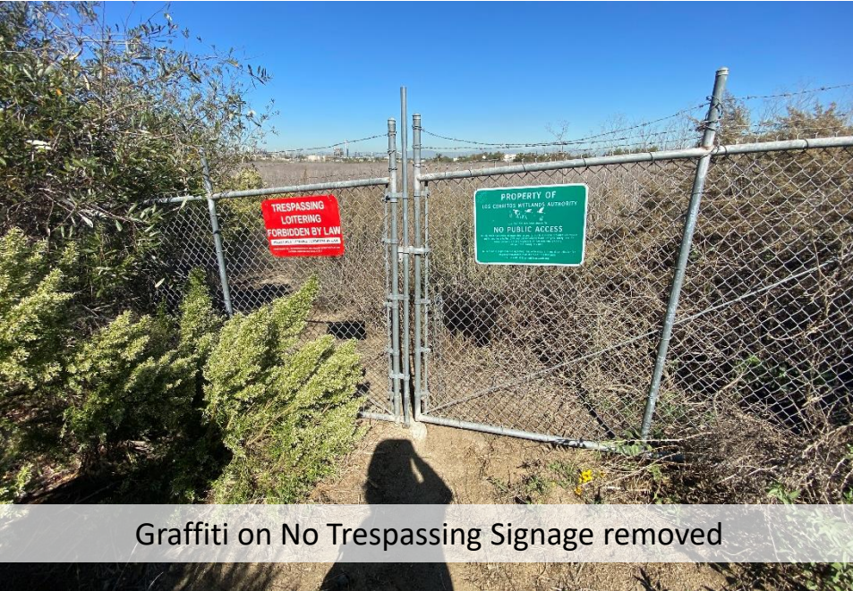
Graffiti on No Trespassing Signage removed