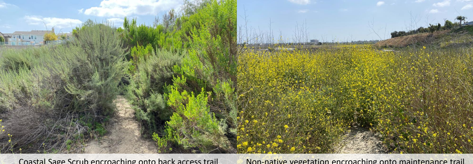
Coastal Sage Scrub encroaching onto back access trail