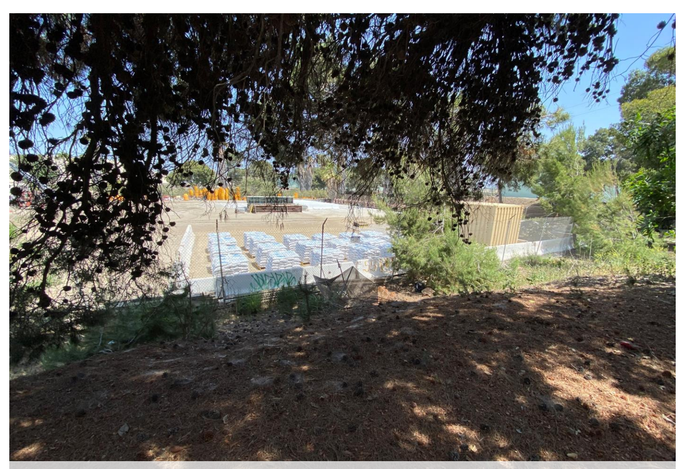
Campsite established along southern fence line remediated