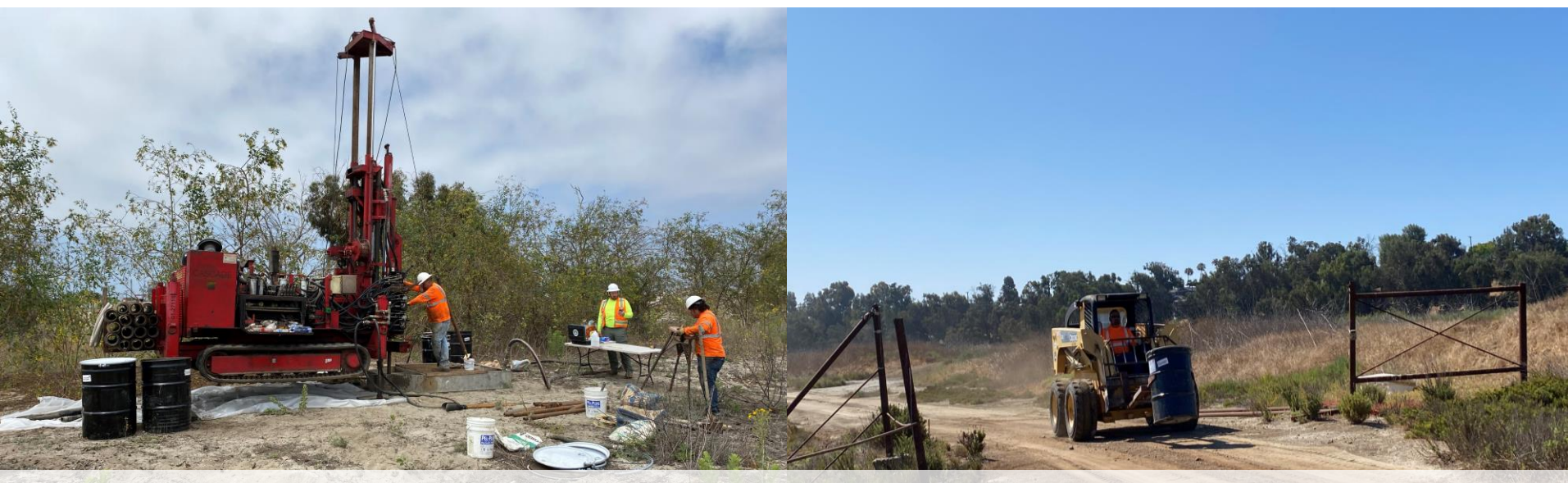
Geotechnical borings conducted throughout South LCWA