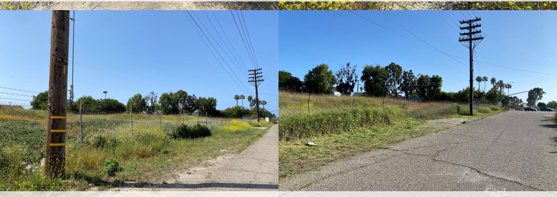
Fence line maintenance conducted in stewardship parking area