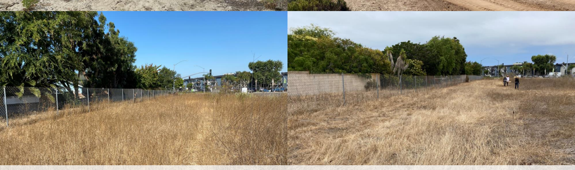
Fence line maintenance conducted