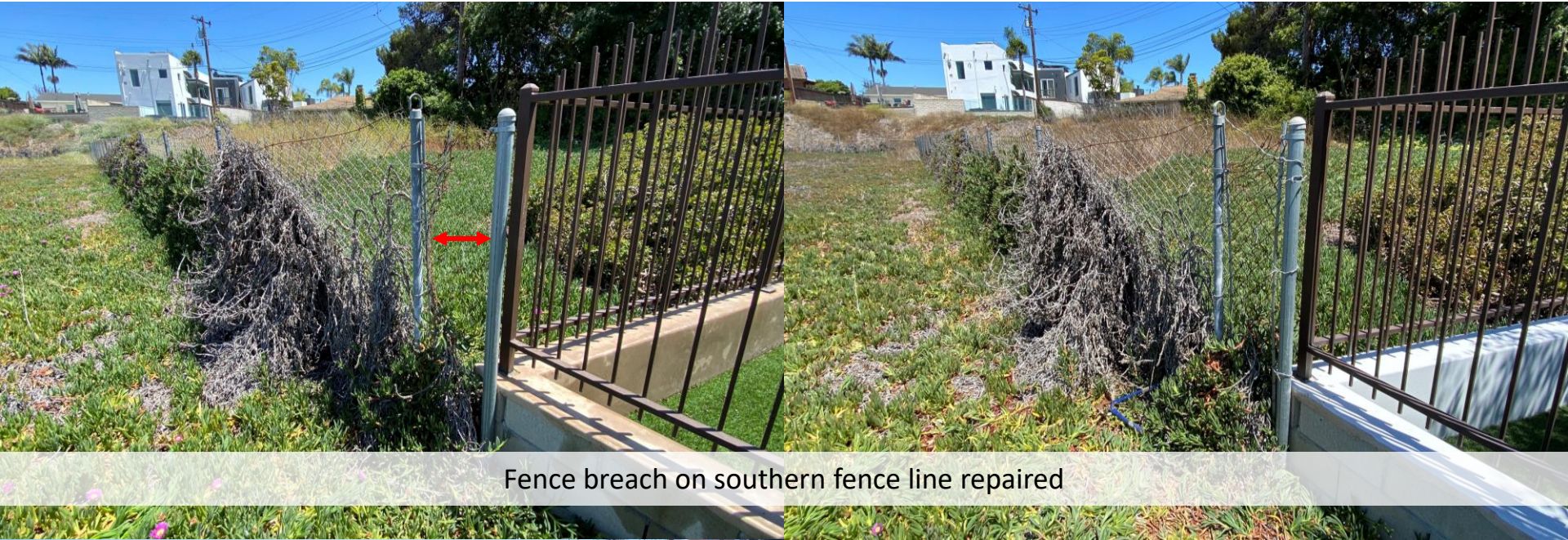
Fence breach on southern fence line repaired