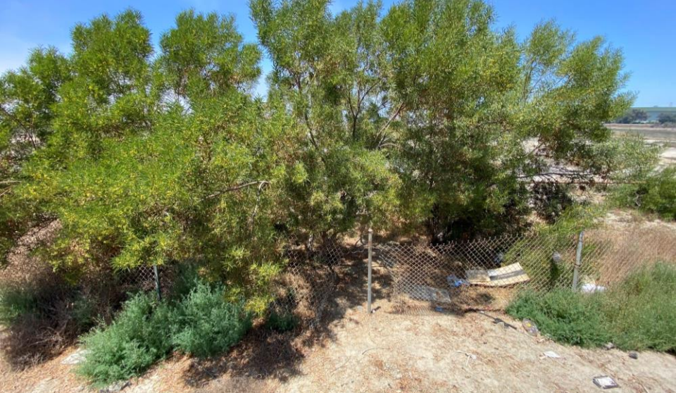
Breaches along eastern fence line