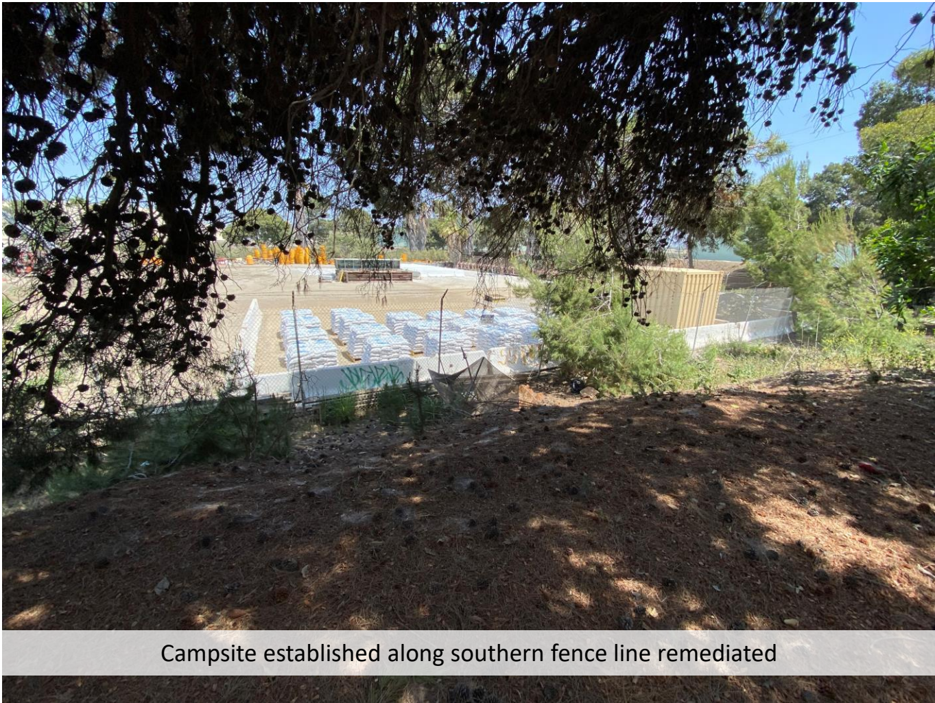
Campsite established along southern fence line remediated