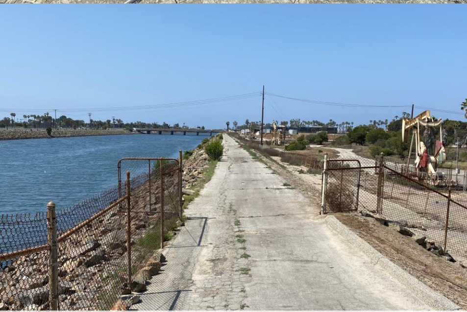
Levee gates left open