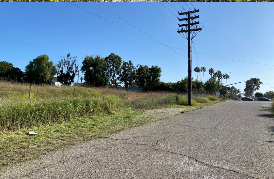
Fence line maintenance conducted in stewardship parking area