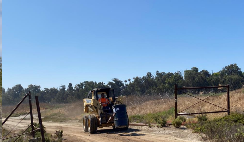
Soil bins removed from project area