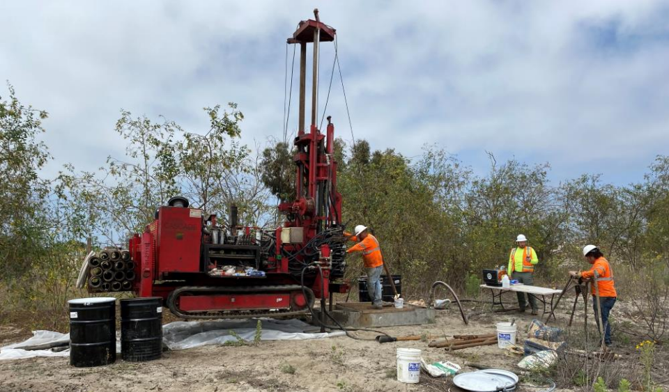
Geotechnical borings conducted throughout South LCWA