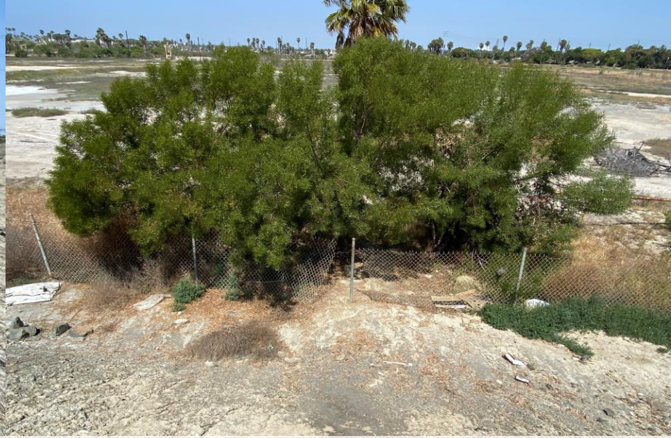
Breaches along eastern fence line