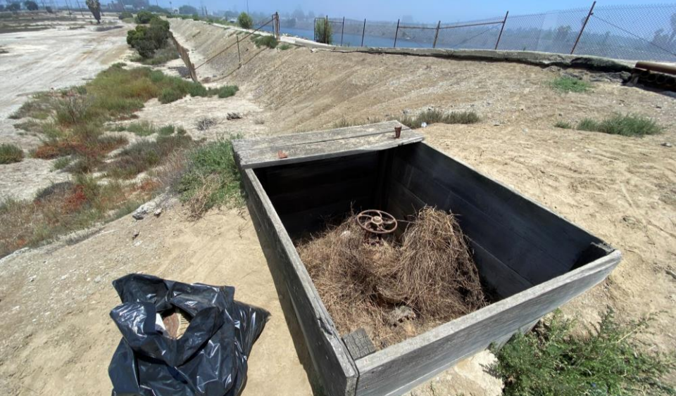
Levee gates left open