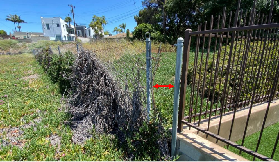
Fence breach on western fence line