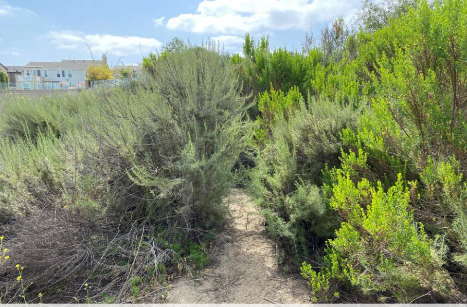
Coastal Sage Scrub encroaching onto back access trail