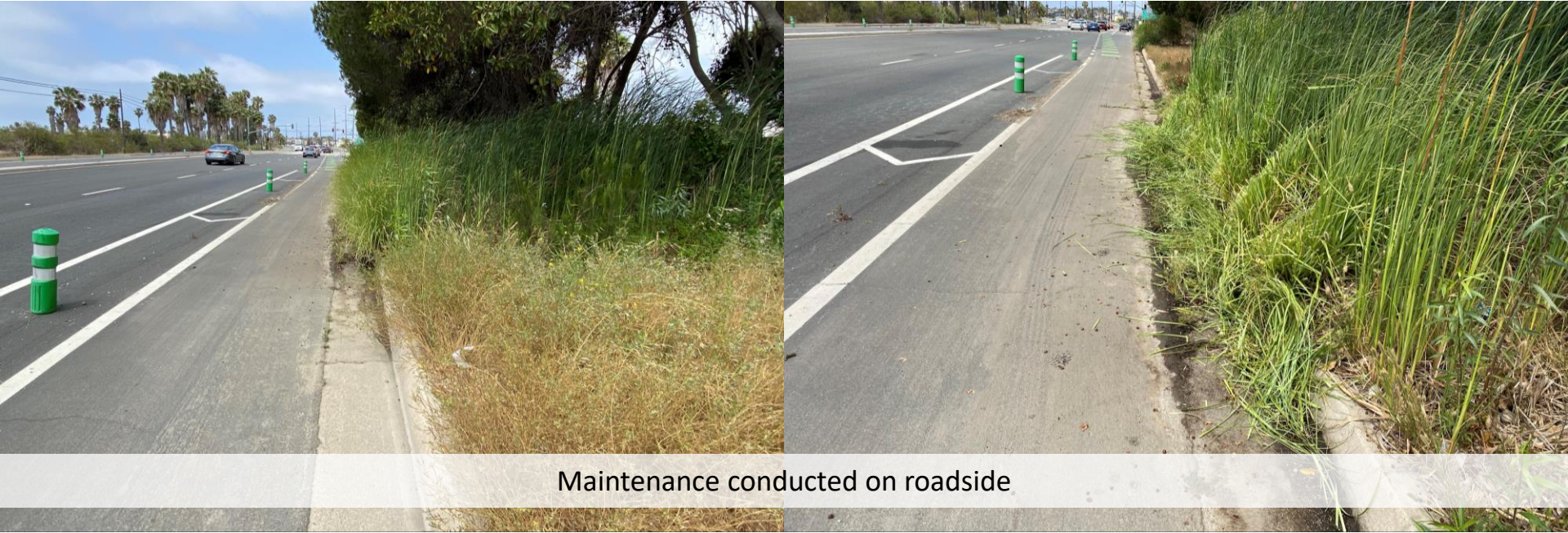
Maintenance conducted on roadside