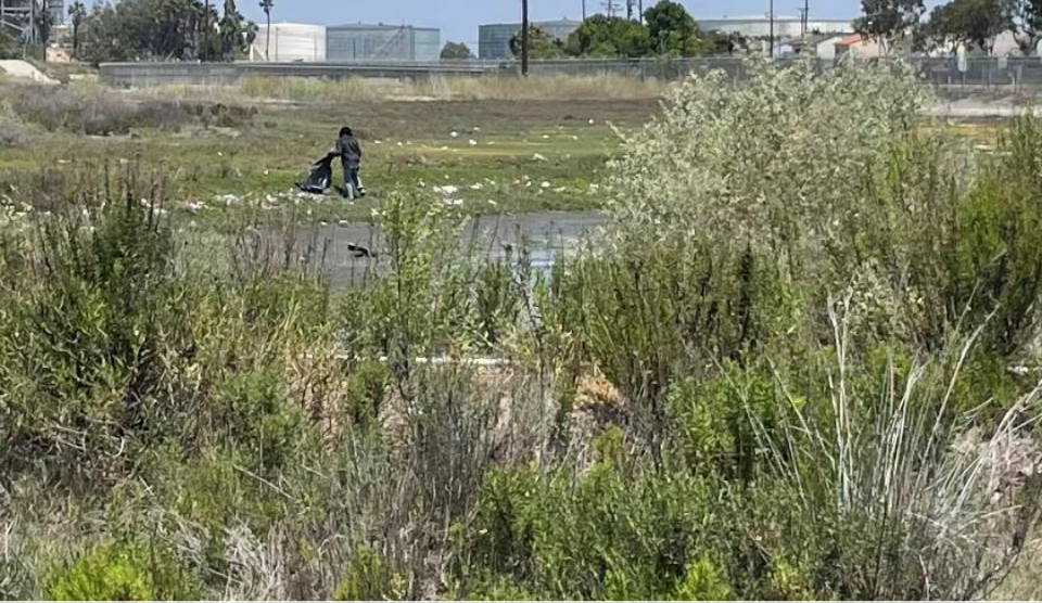
Trespasser in wetlands