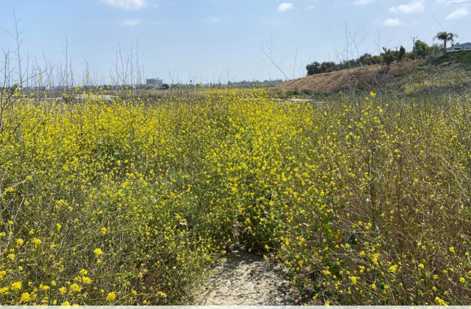
Non-native vegetation encroaching onto maintenance trail