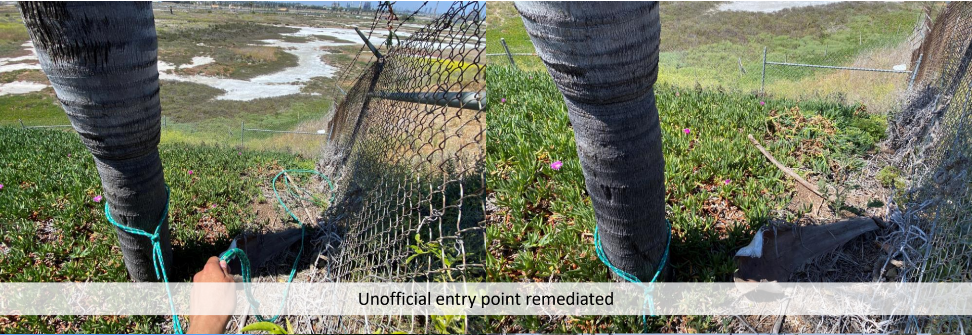
Unofficial entry point remediated