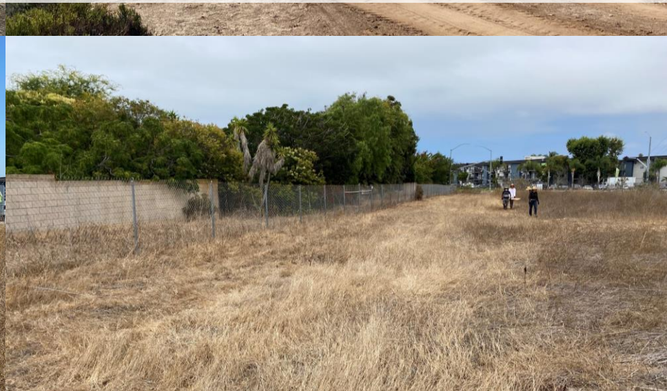
Fence line maintenance conducted