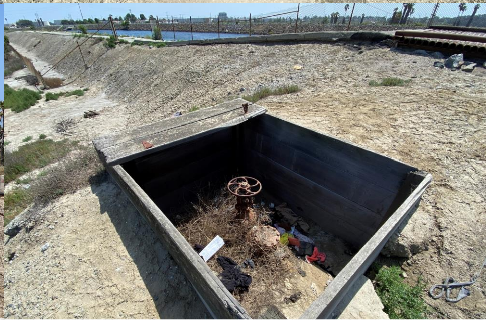
Trash build up around facilities