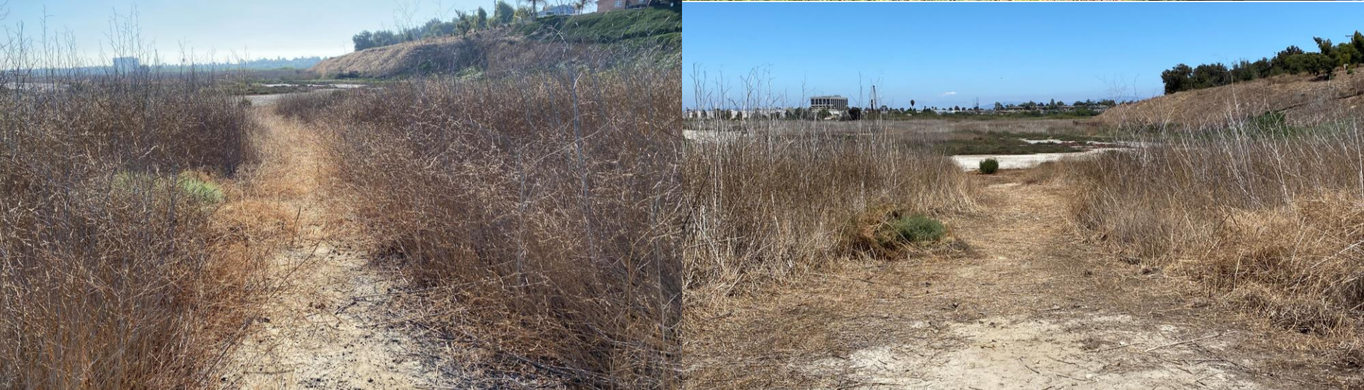
Trail maintenance conducted