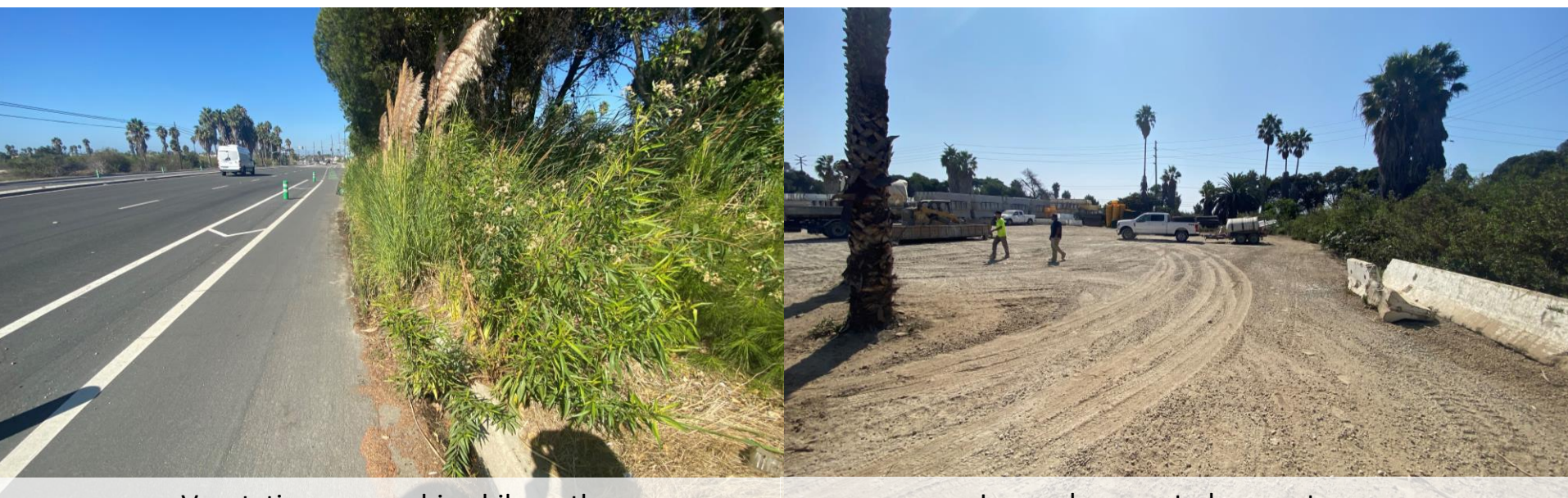
Vegetation encroaching bike path