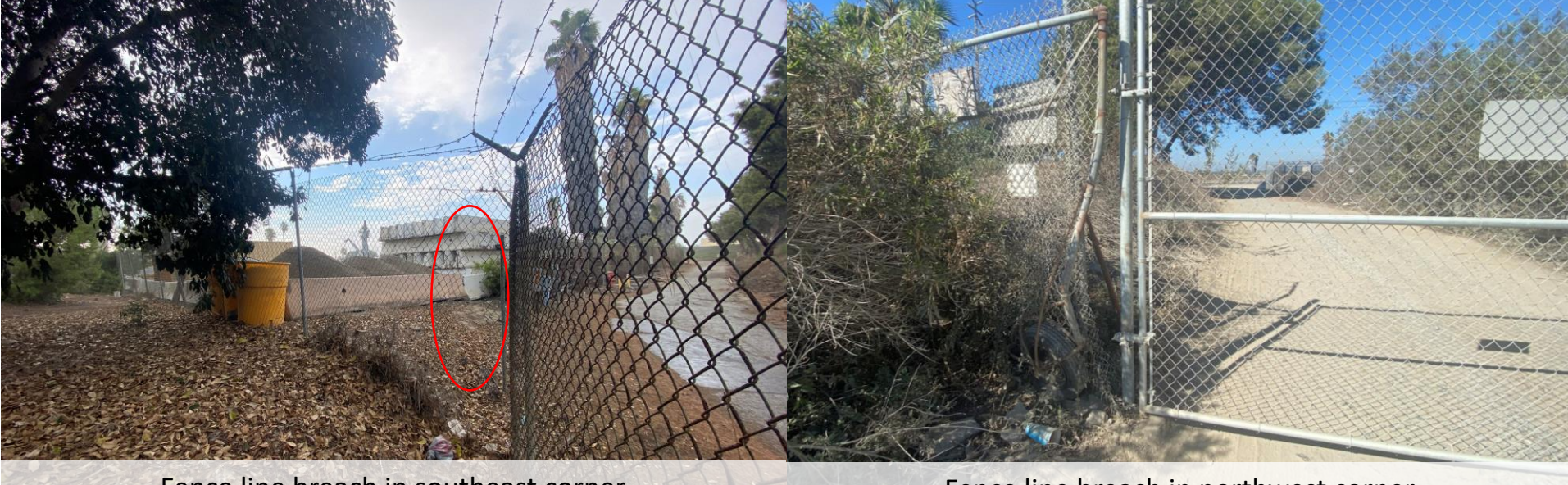
Fence line breach in southeast corner