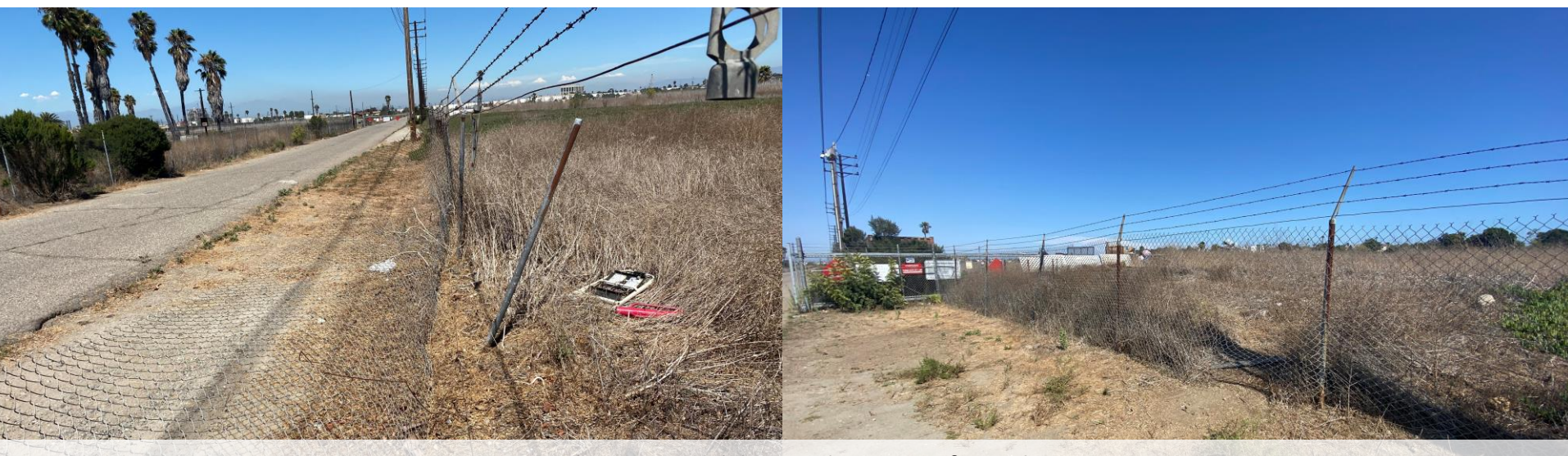
Breach in stewardship parking area fence line