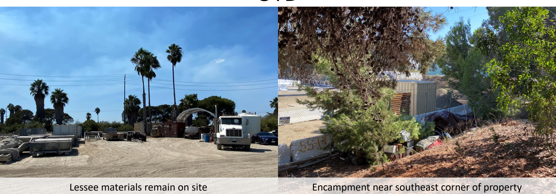
Fenceline breach in southeast corner of property