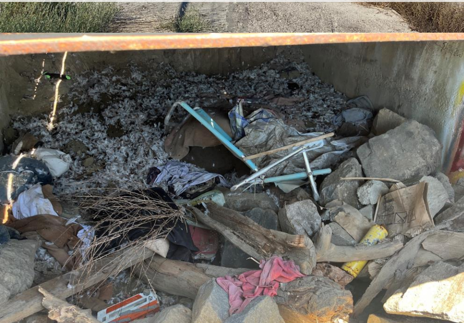
Encampment materials under cattle grate