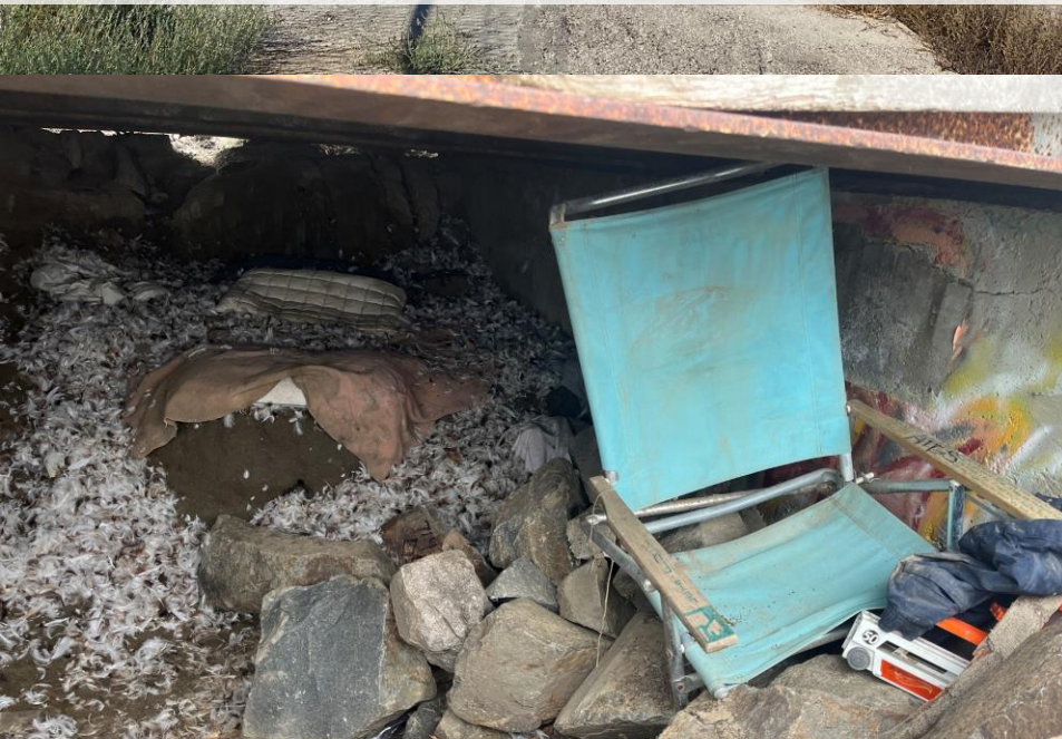
Encampment materials under cattle grate