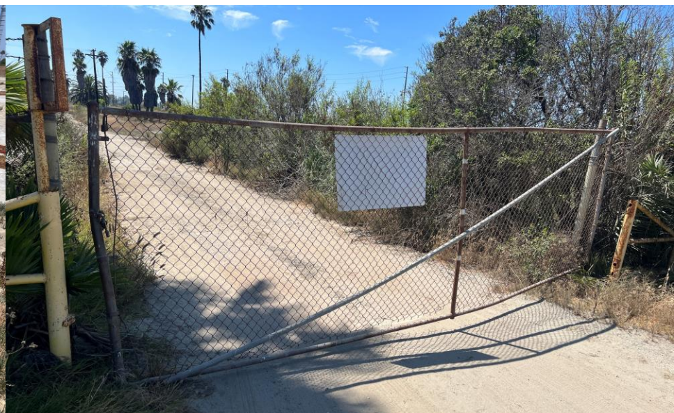
Entrance gate damaged