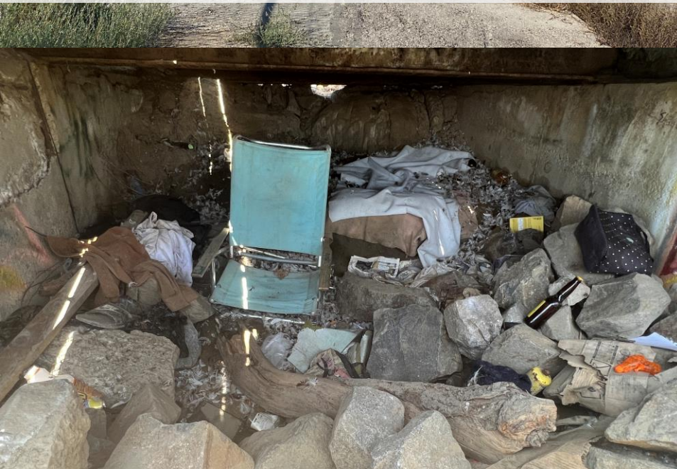
Encampment materials under cattle grate