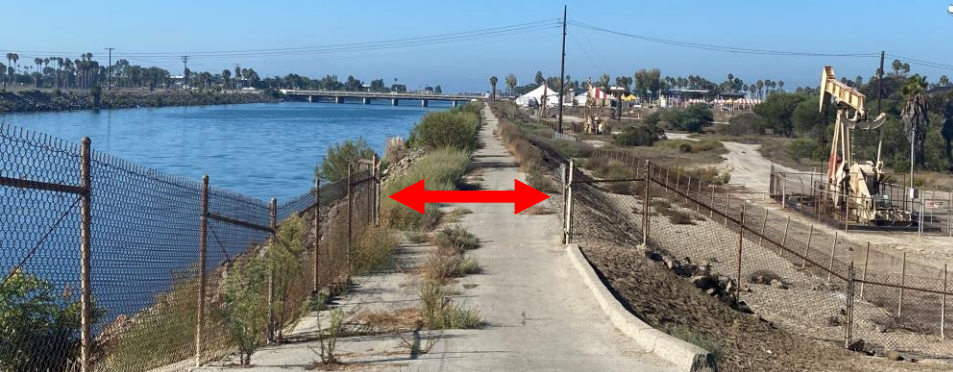
Levee gates found open