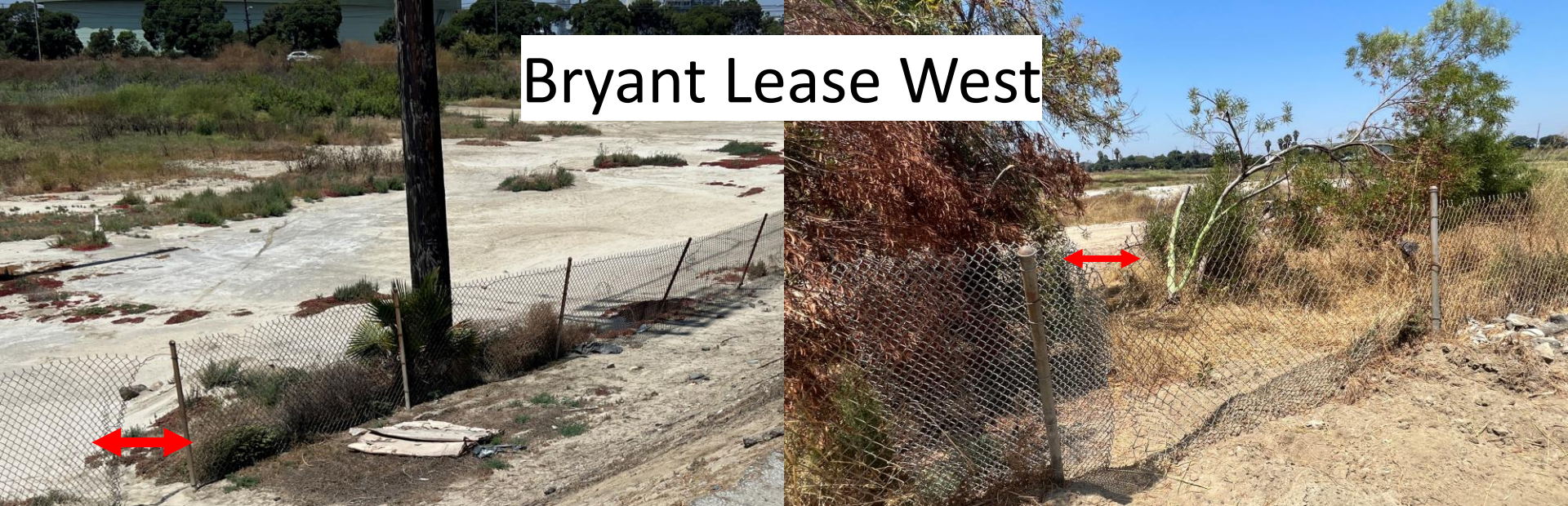
Breaches in fence