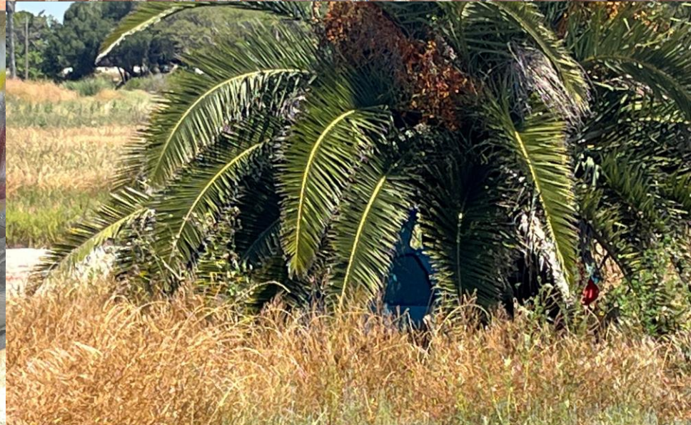
Encampment under Canary Island Palm