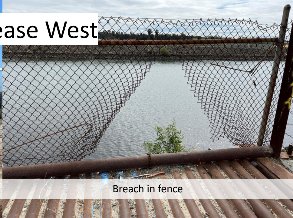
Breach in fence