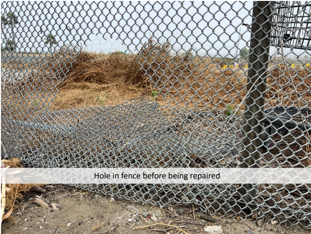
Hole in fence before being repaired