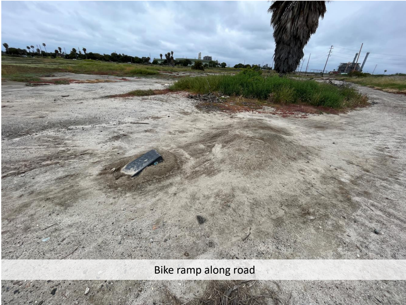
Bike ramp along road