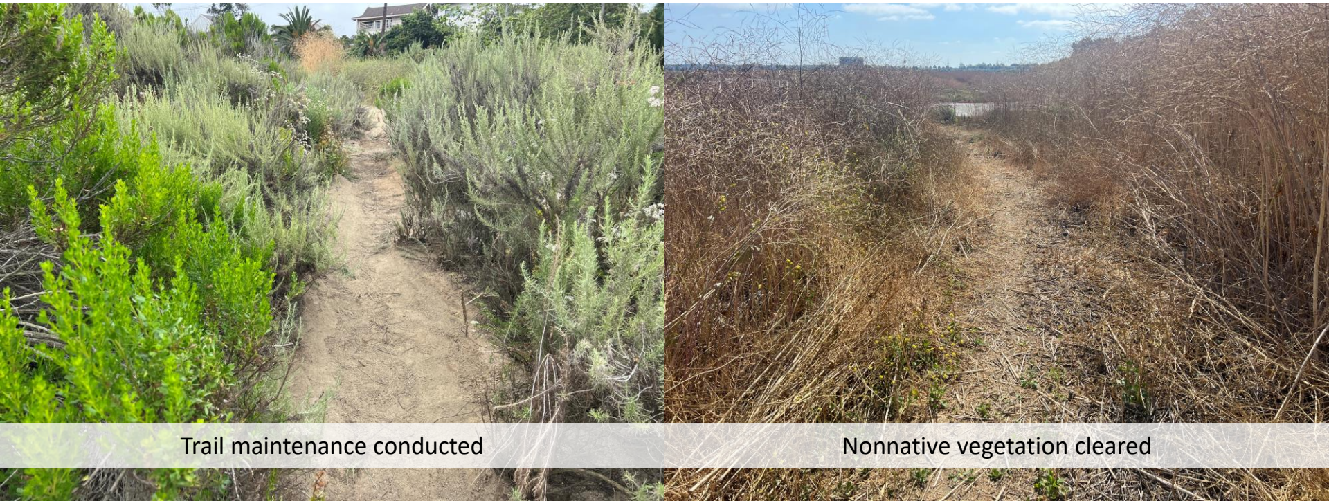
Trail maintenance conducted