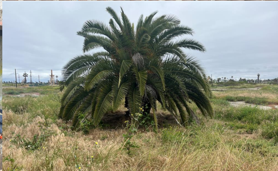
Encampment remediated from Canary Island Palm