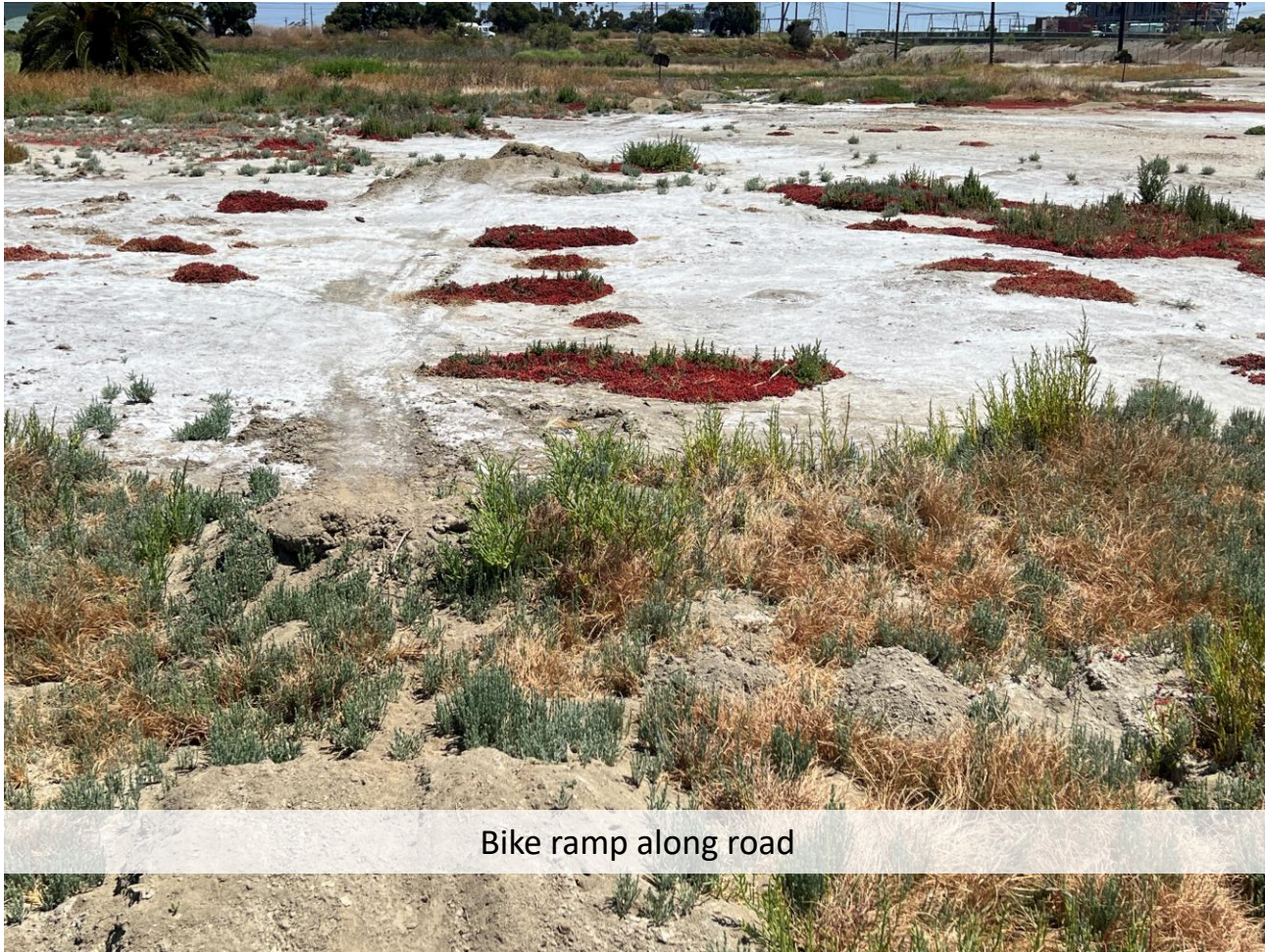
Bike ramp along road