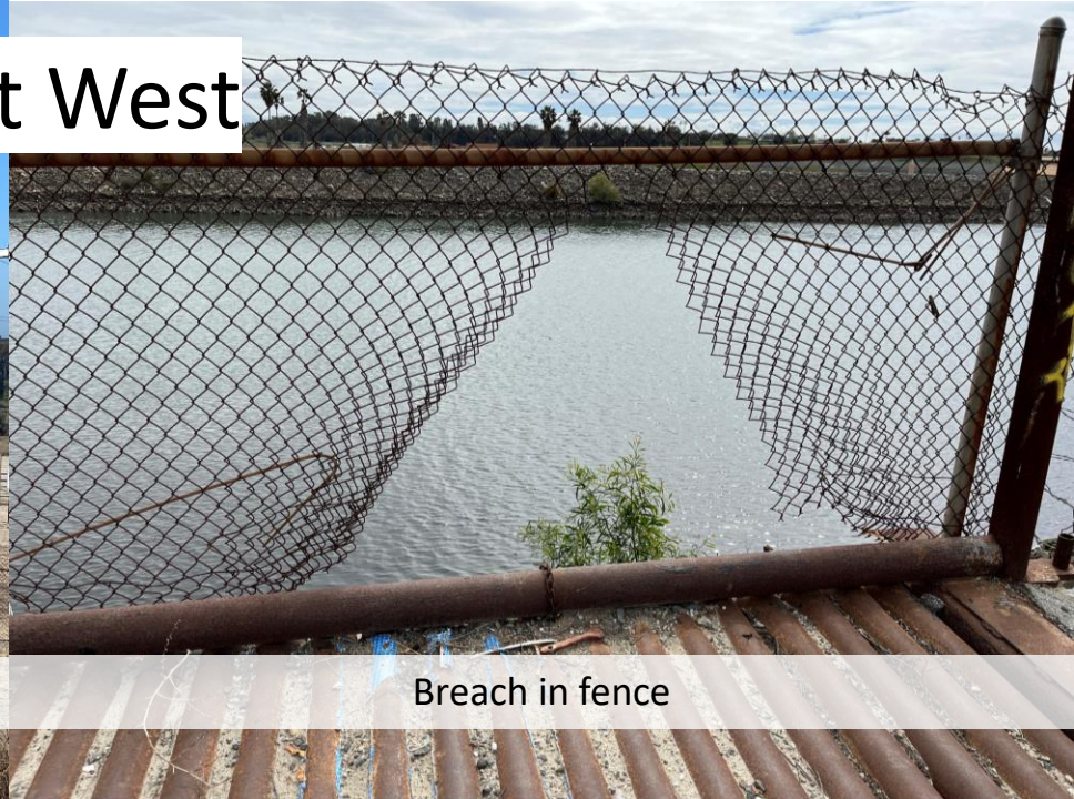
Breach in fence